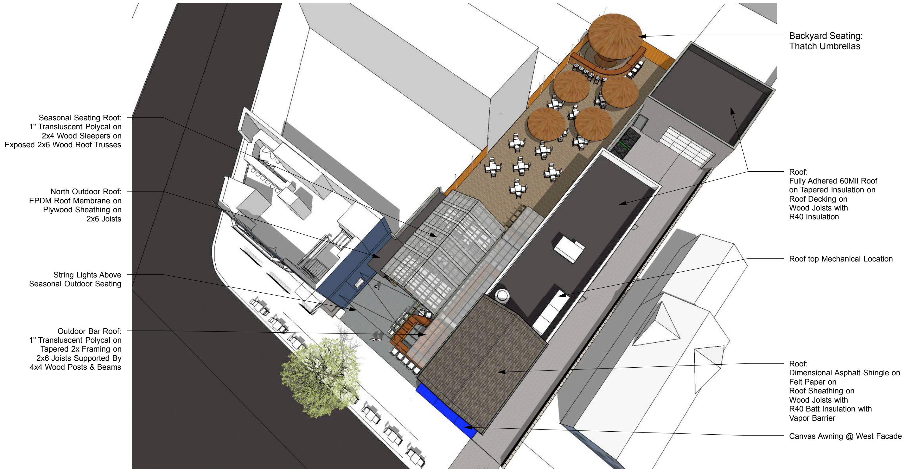
1 A2.2 ROOF LEVEL - AERIAL PERSPECTIVE Scale: NTS