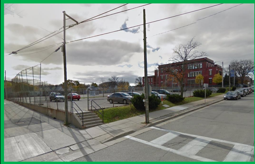
View East Dover Street looking south