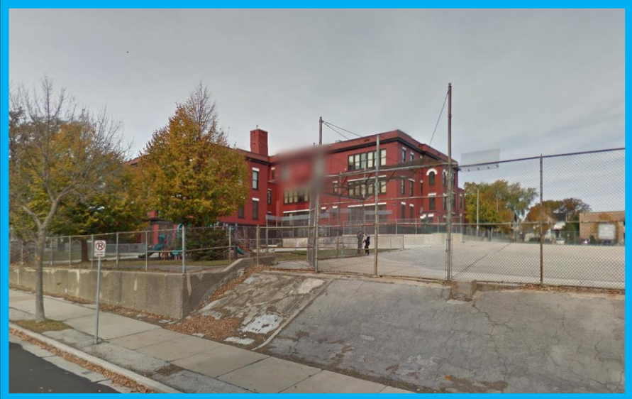
View from East Potter Avenue looking west