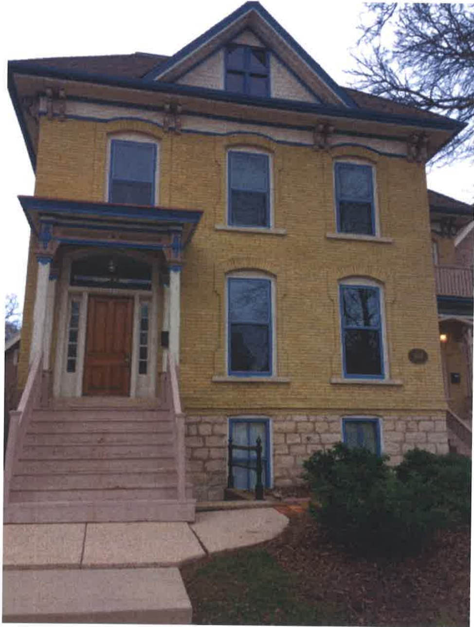
1910 N 2nd St front of property facing West