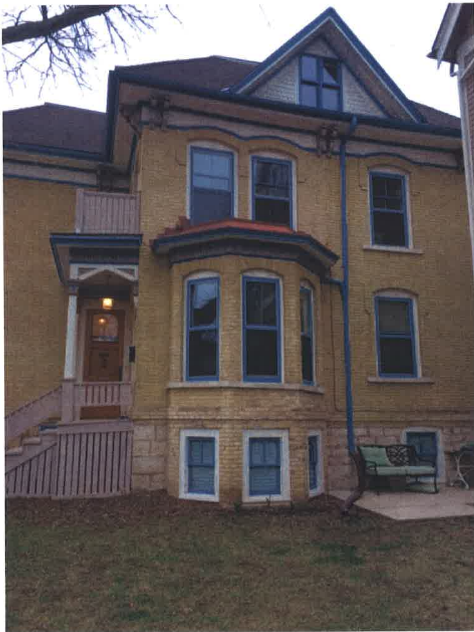
1910 N 2nd St South side of property