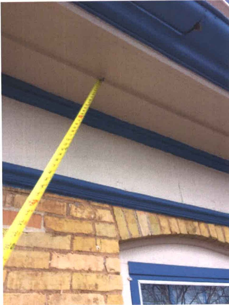
A. Enlarged photo indicating location of bathroom exhaust fan vent.