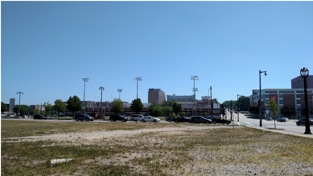
View from West (Water Street)