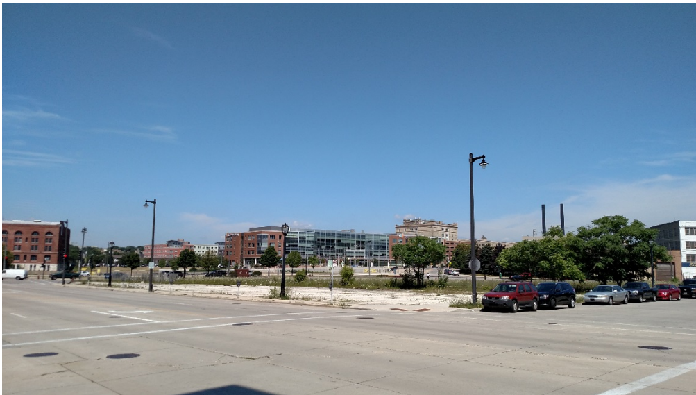
View from SE (Market & Knapp Streets)