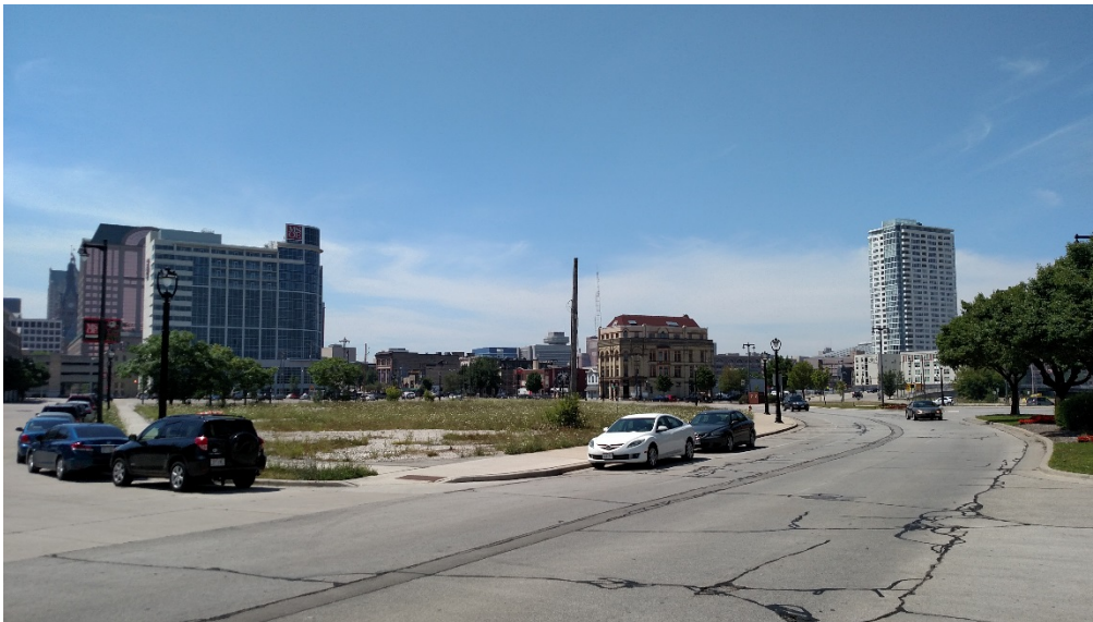
View from NE (Water Street)