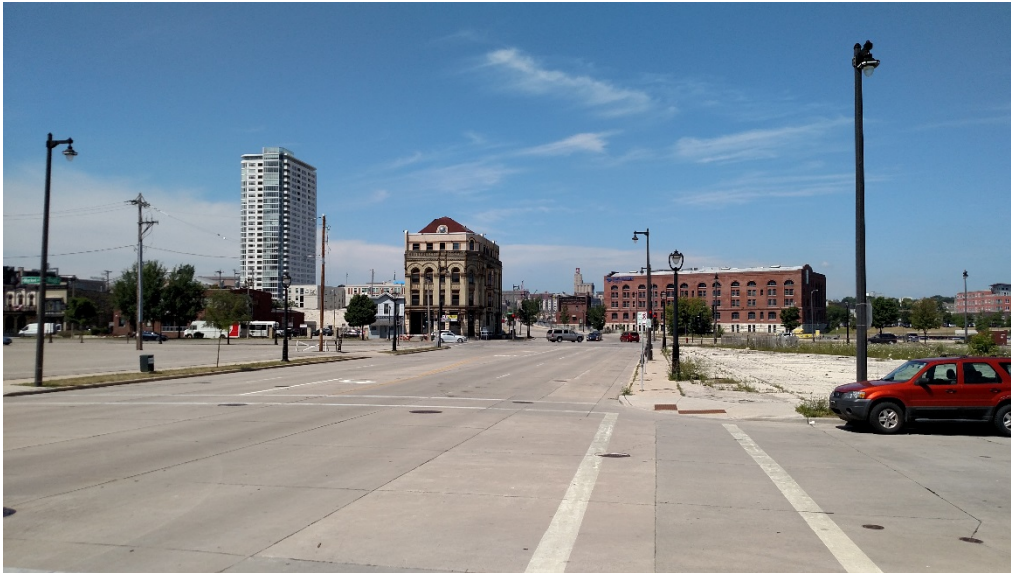
View from East (Market Street)