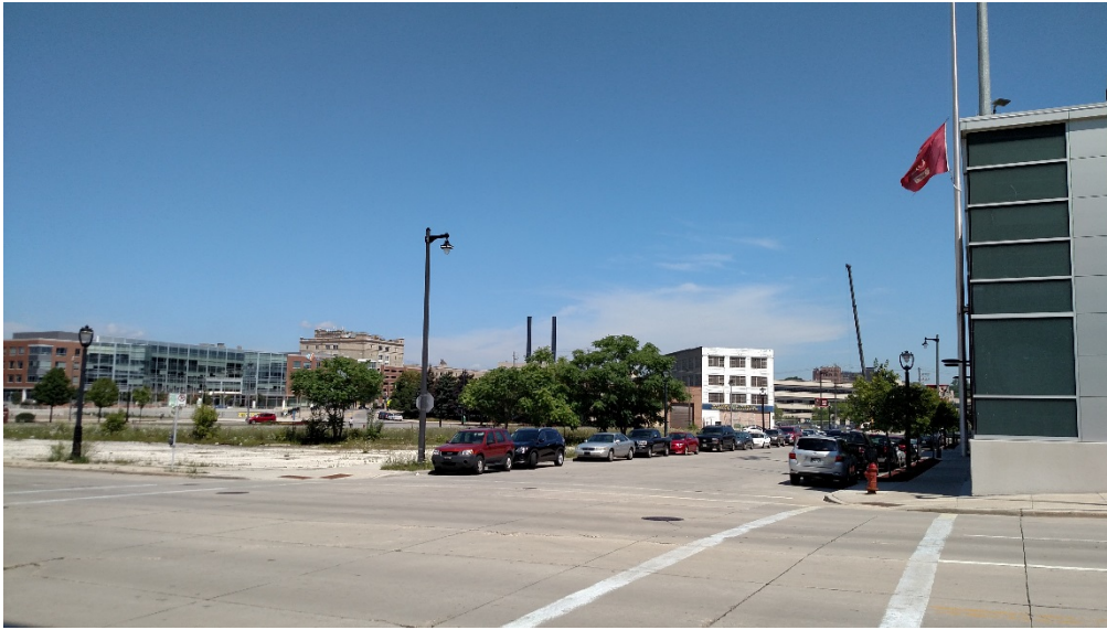
View from SE (Market & Knapp Streets)