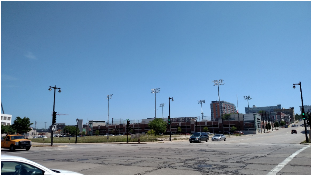
View from SW (Water & Knapp Streets)