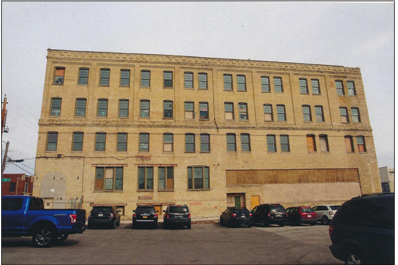
Wisconsin Historic Preservation Database, 2018 photograph (WHPD #110095) West elevation – appearance of the building when National Register-listed in 2018