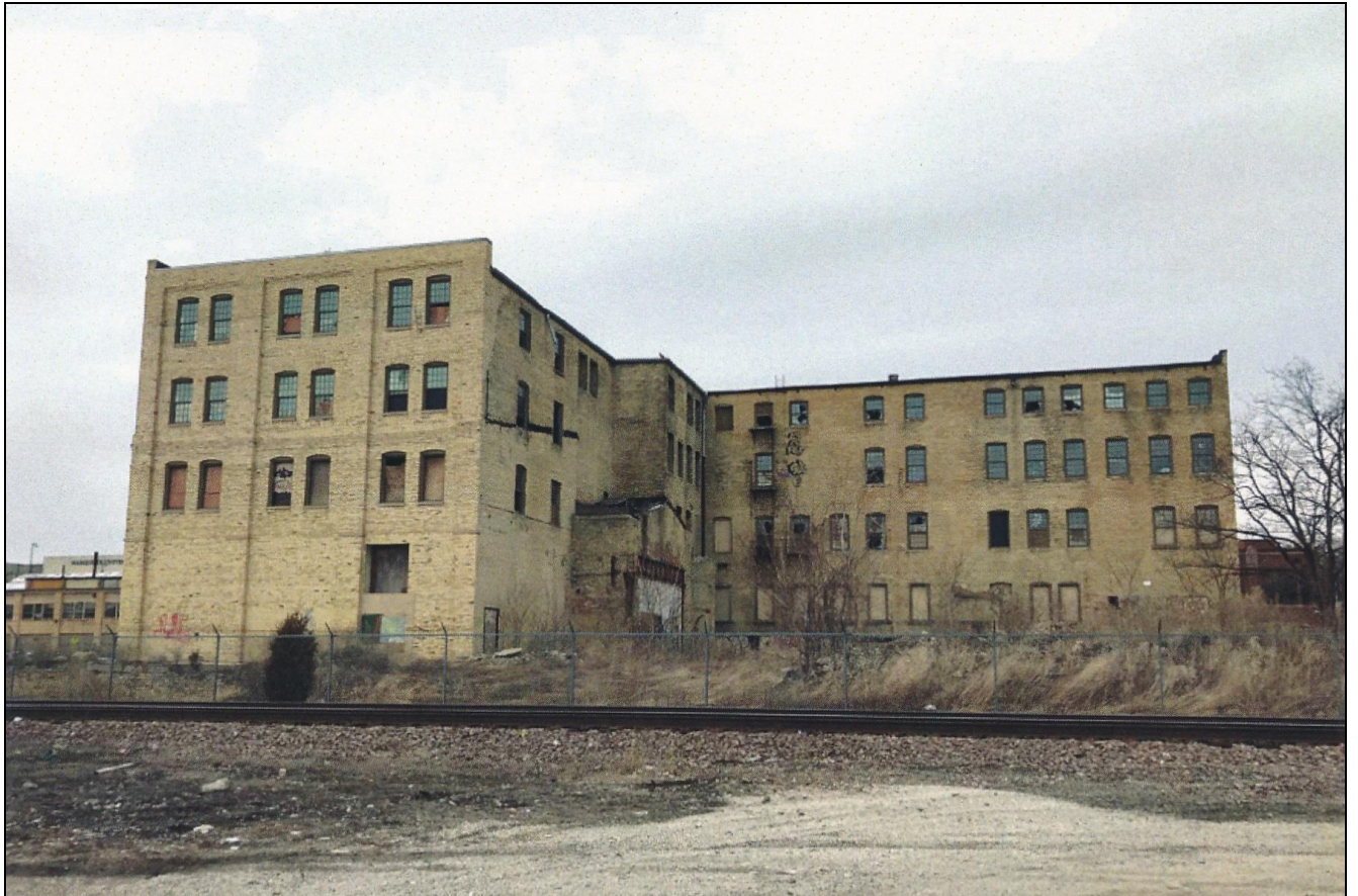
Wisconsin Historic Preservation Database, 2018 photograph (WHPD #110095) South elevation – appearance of the building when National Register-listed in 2018