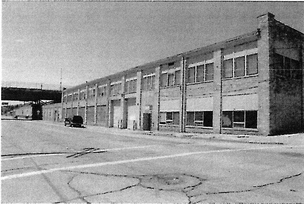
Figure 34. View from W. St. Paul Avenue and N. 15 th Street, facing northwest.