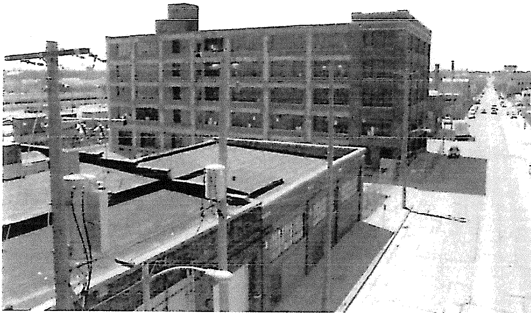
Figure 33. View along W. St. Paul Avenue from 16 th Street viaduct, facing southwest.