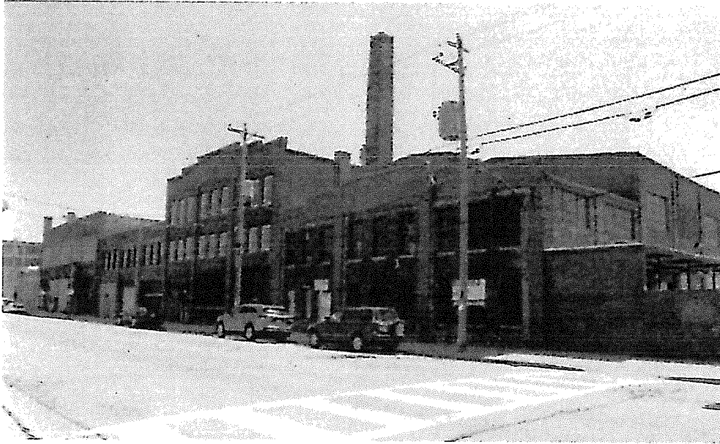
Figure 32. 1819-1739 W. St. Paul Avenue, view facing southeast.