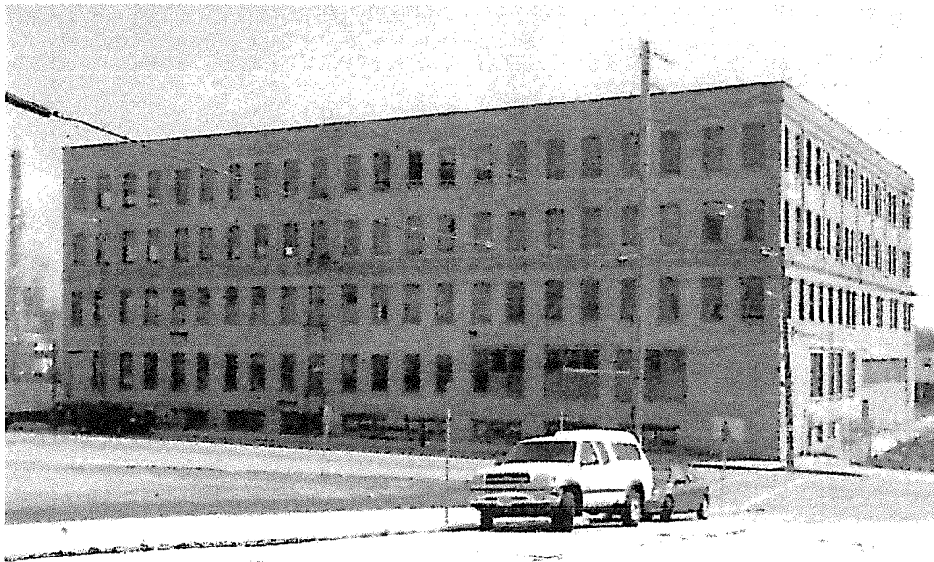
Figure 35. Geuder, Paeschke & Frey factory, 324 N. 15 th Street, view facing southeast.