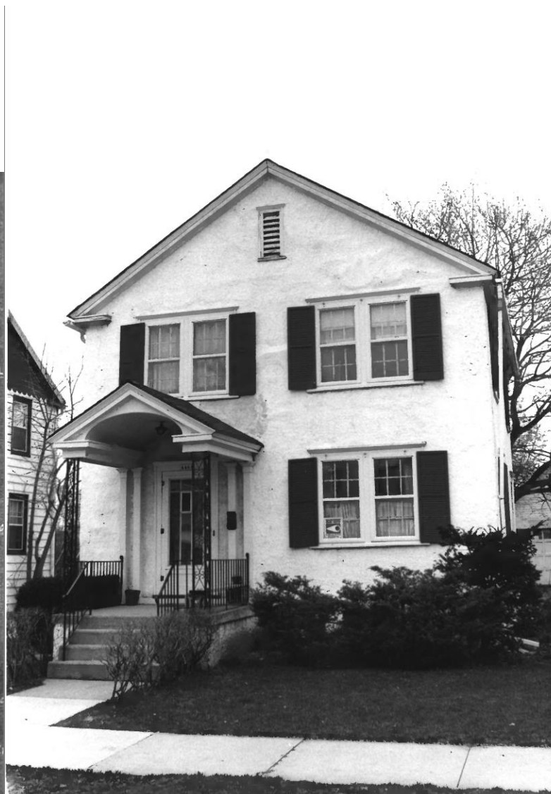
Architect's original house design 6A for this property and photograph of a house of this design in 1988. The photograph is representative only.