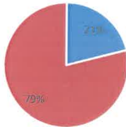
Gender Diversity - All of Operations

While the overall diversity within the Operations division is representative of Milwaukee, the division embraces the importance of providing and promoting equity within managerial ranks. Currently management employees are 60% white, and 40% non-white. The division has started a supervisor mentorship and development program to support and foster employees who are interested in furthering their careers.