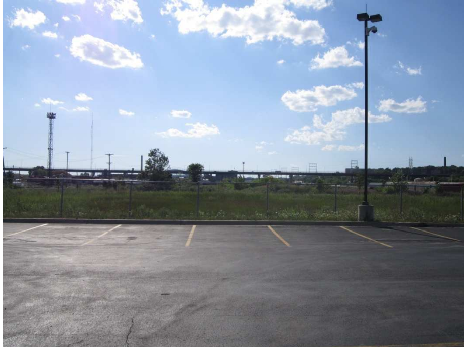
West View from Biogas Generation Site