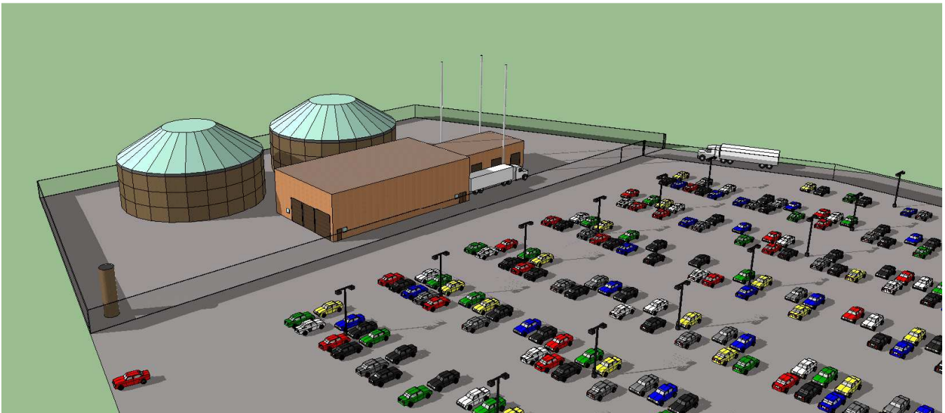
Digester Facility Overview