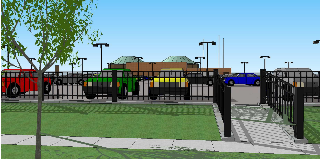
Eye Level View from W. Potawatomi Cir.