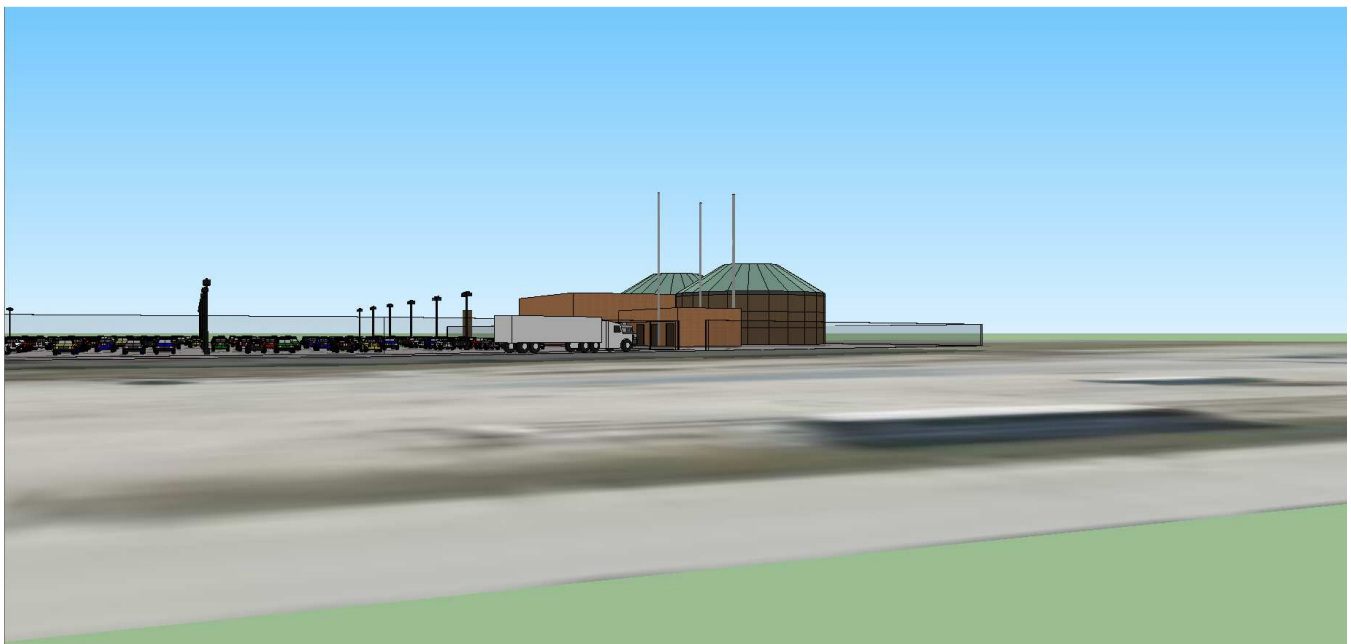
Eye Level from W. Canal St. (No CP Rail Obstructions Shown)