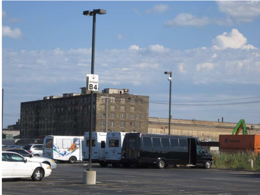
Southeast View from Biogas Generation Site