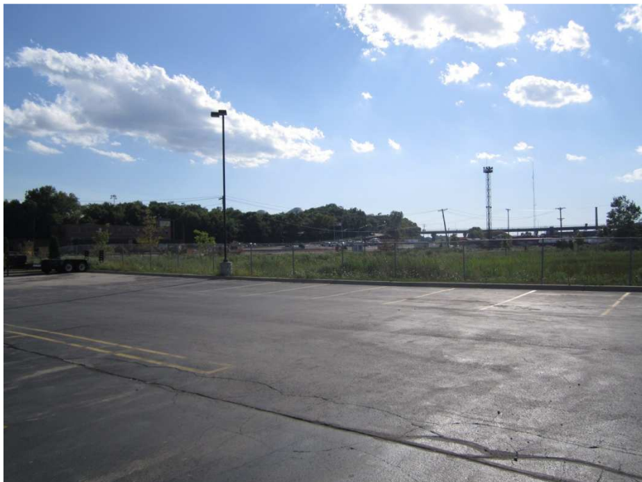
Southwest View from Biogas Generation Site