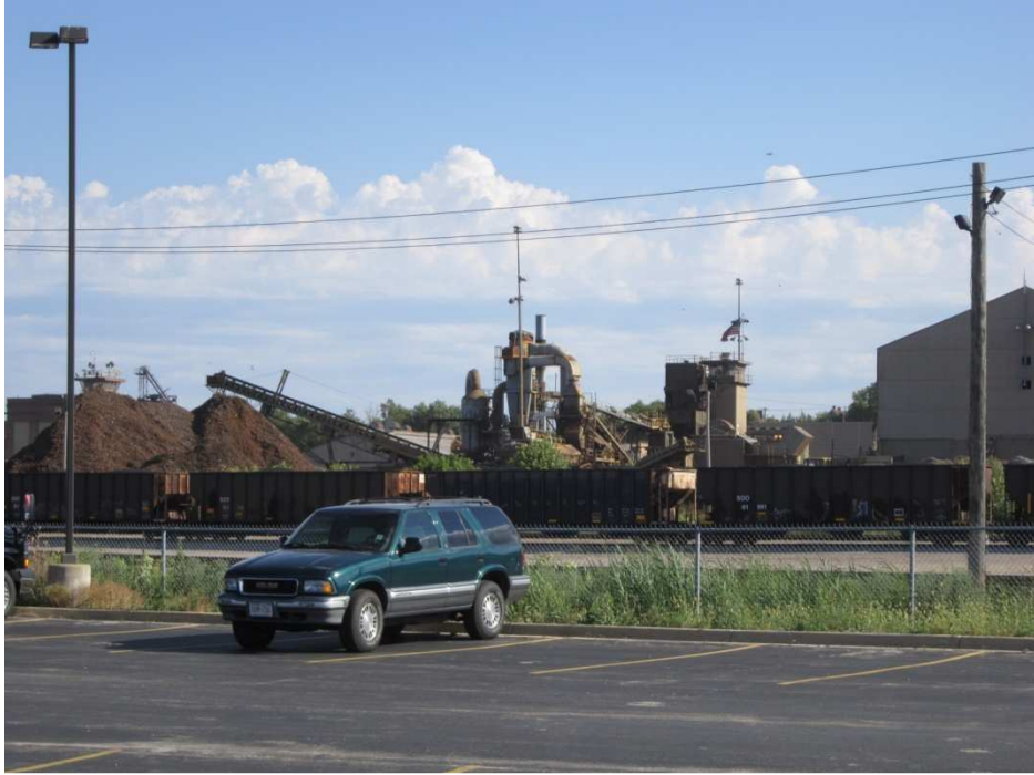
South View from Biogas Generation Site