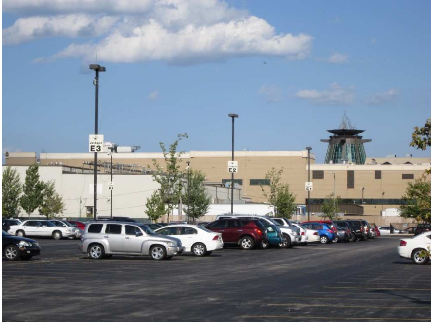
East – Northeast View from Biogas Generation Site