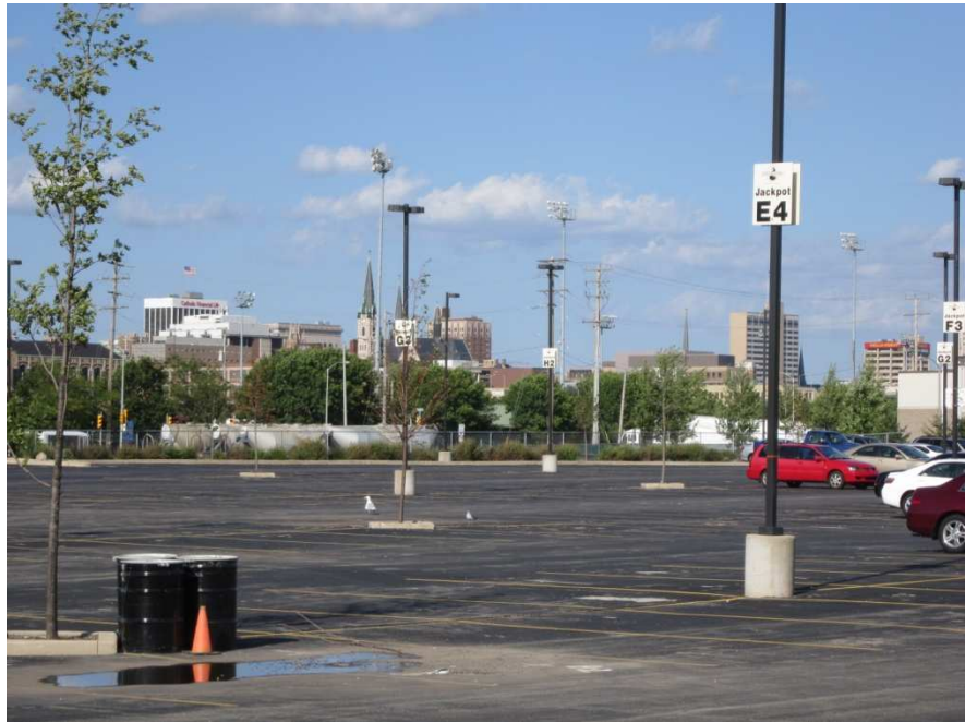
Northeast View from Biogas Generation Site