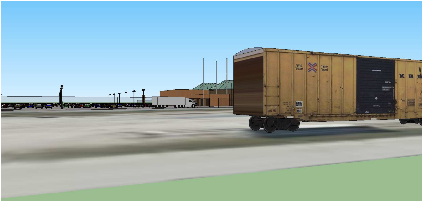
Eye Level from W. Canal St. (Example CP Rail Obstructions Shown)