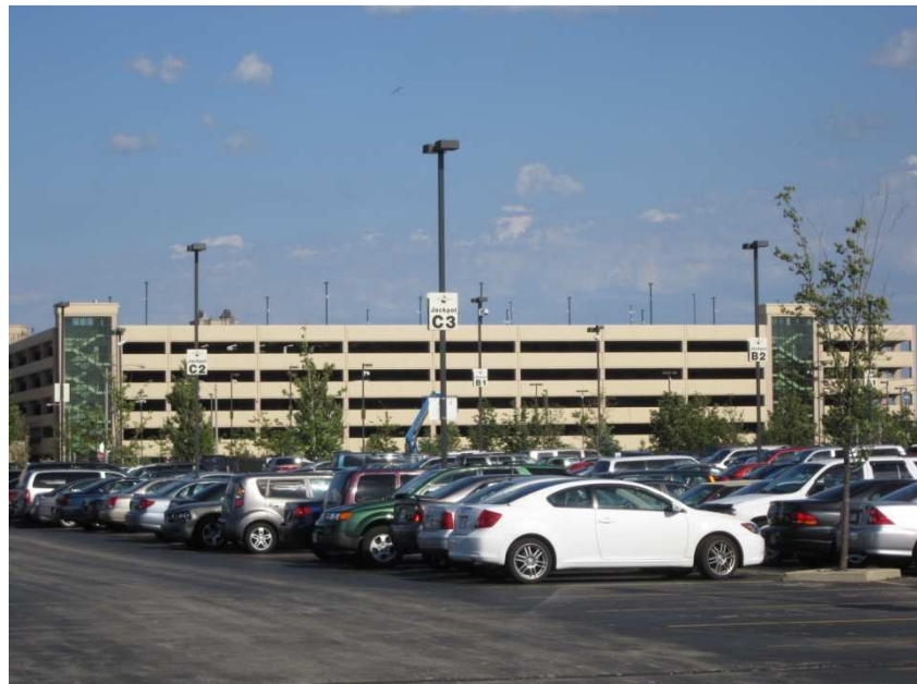
East – Southeast View from Biogas Generation Site