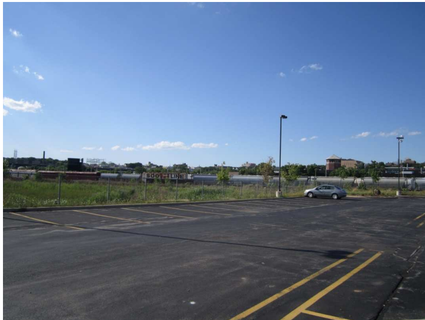
Northwest View from Biogas Generation Site