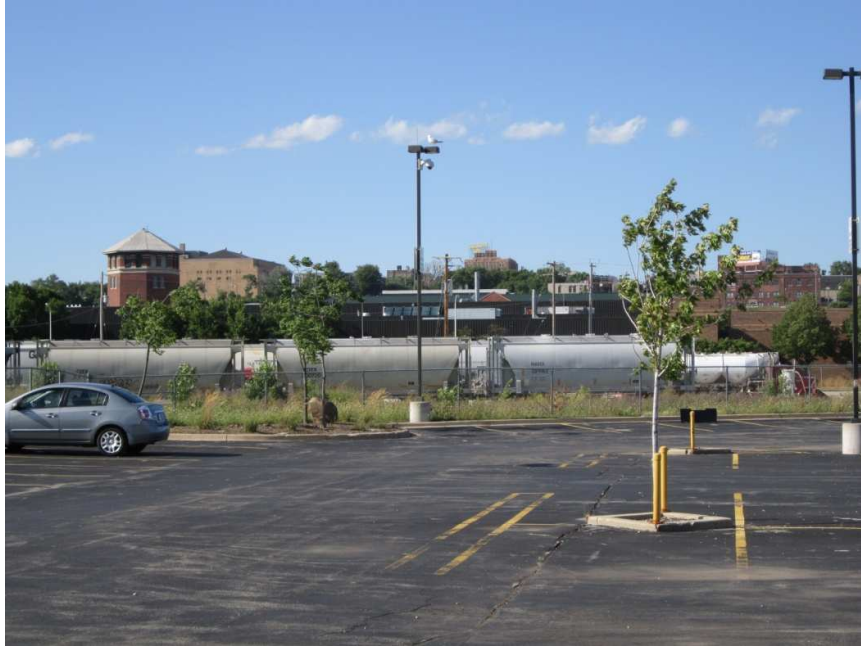
North View from Biogas Generation Site