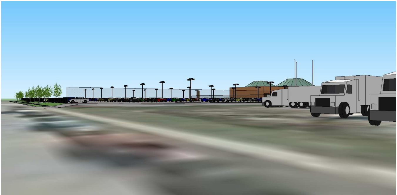
Eye Level from W. Canal St. and W. Potawatomi Cir. (Example CP Rail Obstructions Shown)