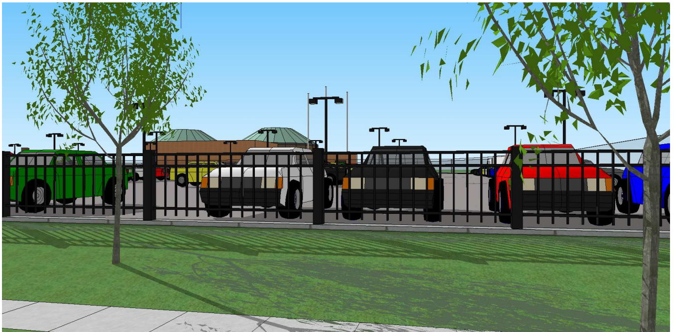
Eye Level View from W. Potawatomi Cir.