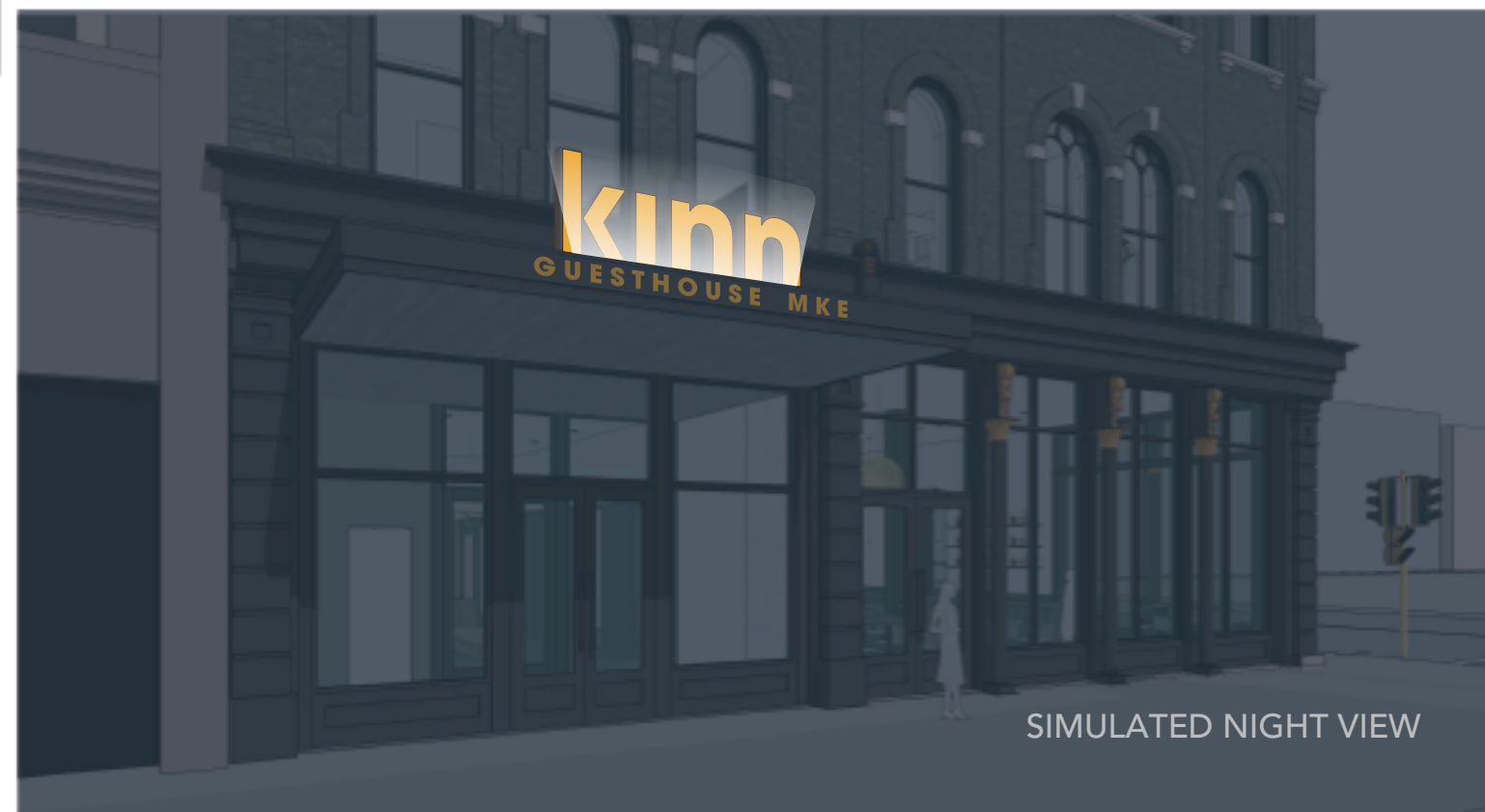
SIMULATED NIGHT VIEW