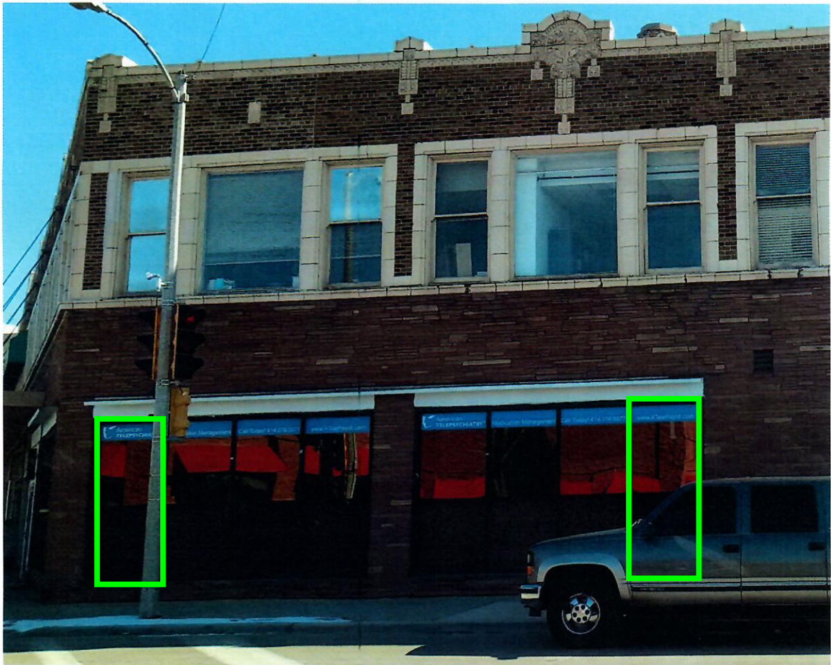
Detail of the West elevation on S 13 th Street showing where we will remove the two windows for two new exit doors.