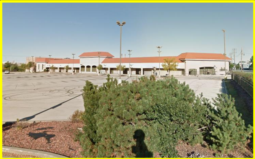
View northeast from South 19th Street