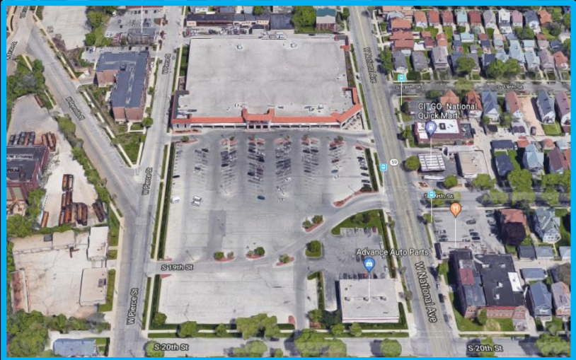
Arial view east from South 20th Street