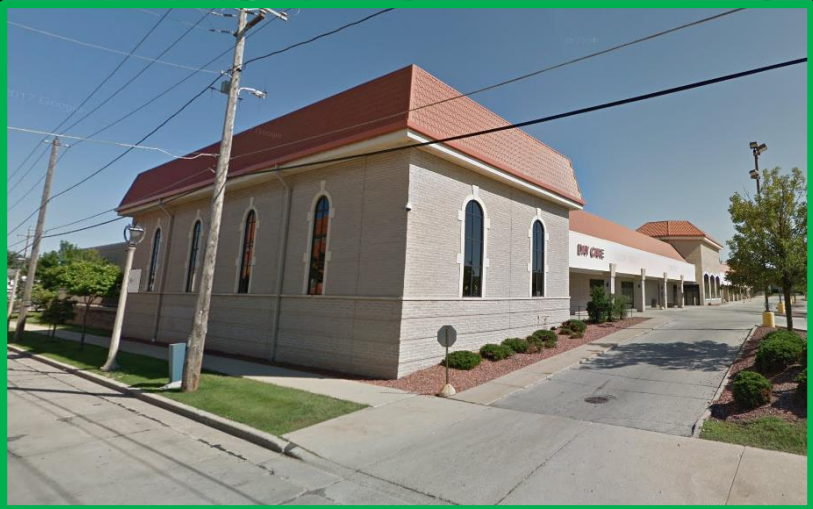
View southeast from West Pierce Street