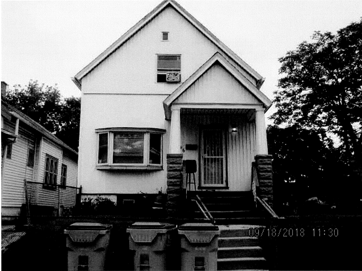
3746 North 2 nd Lane