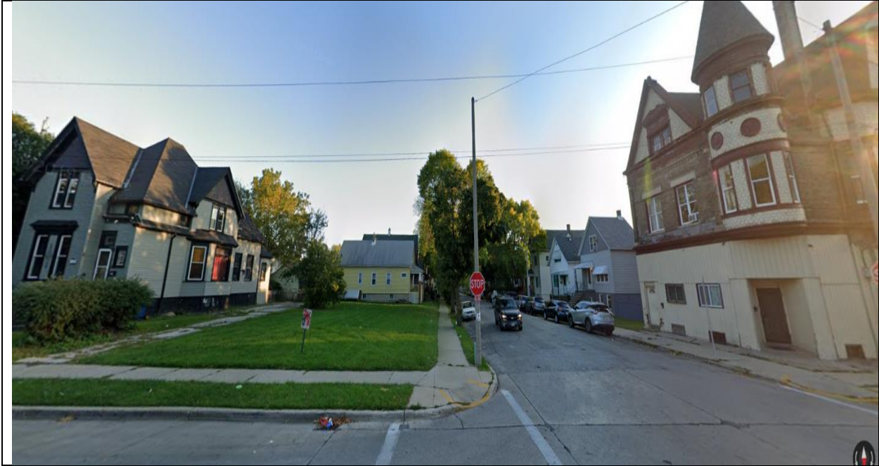
VIEW TO SOUTH OF 1335 WEST BECHER STREET