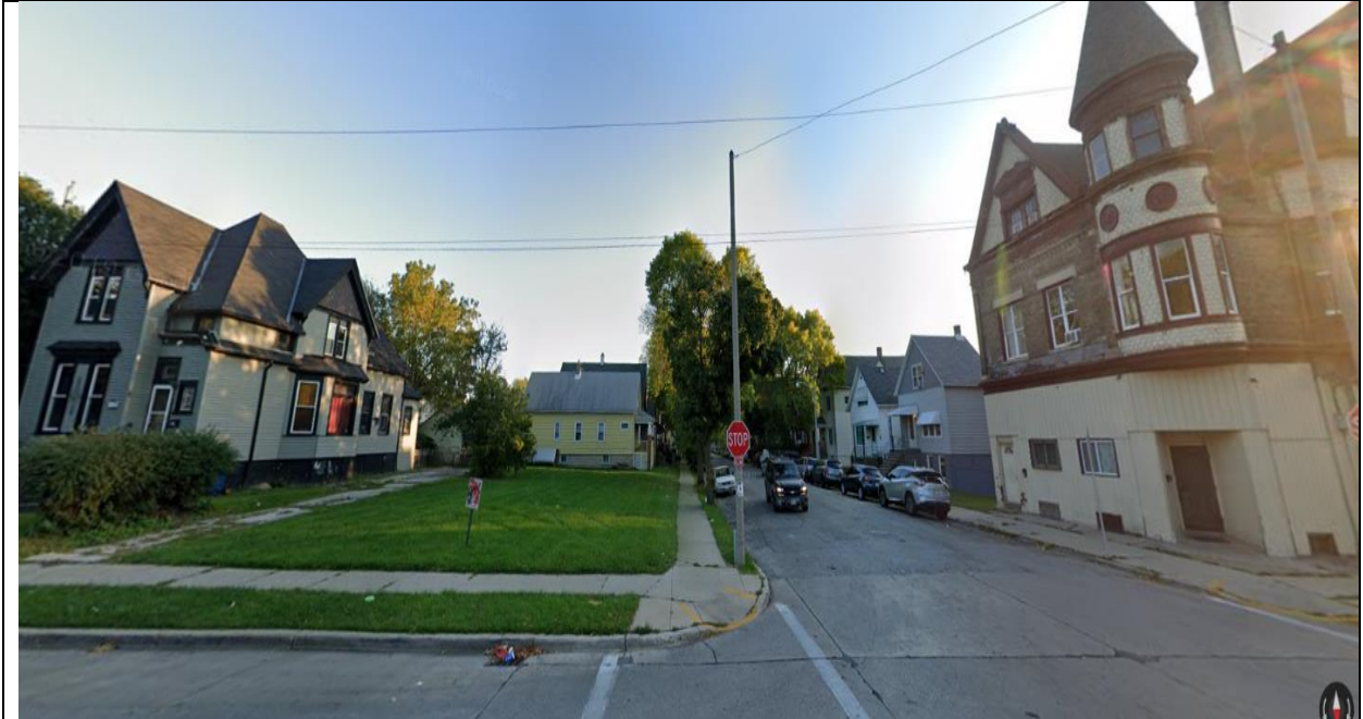
VIEW TO SOUTH OF 1335 WEST BECHER STREET