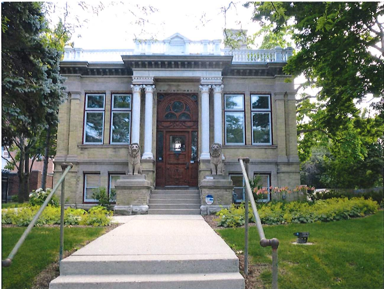
Image A: North façade of the Lion House showing the entry stair and flanking lions.