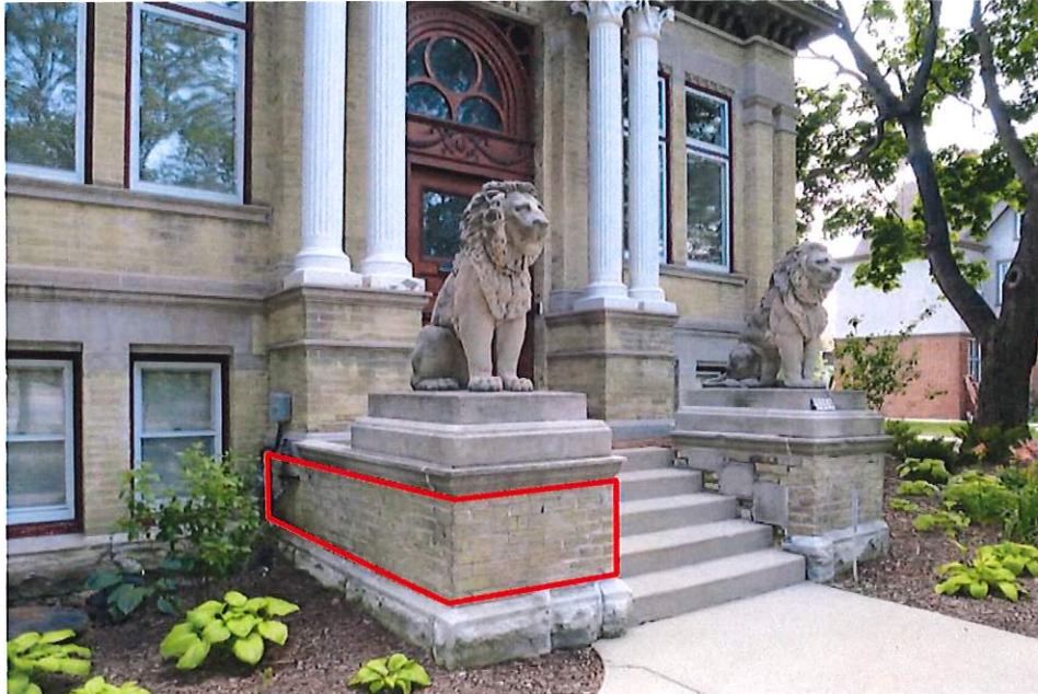
Image E: East pier – The area outlined in red will be spot repointed using a mortar matching the original. Due to severely decomposed bedding mortar, brick may require removal and resetting in new bedding mortar.