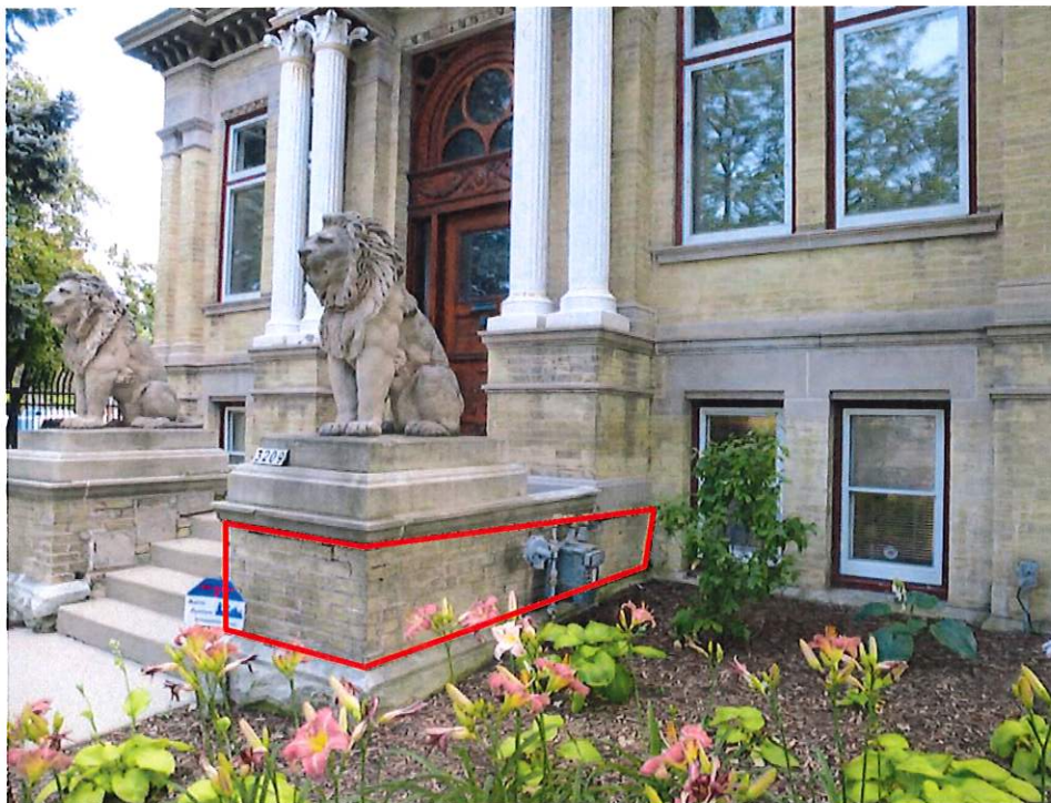
Image H: West pier – The area outlined in red will be spot repointed using a mortar matching the original. Due to severely decomposed bedding mortar, brick may require removal and resetting in new bedding mortar. Spalling brick will be replaced with salvaged matching units.