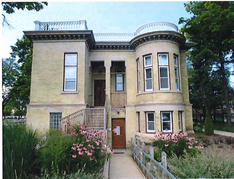
Image C: South façade, select bricks at the basement level will be replaced with historic matching units.