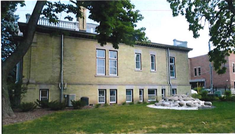
Image B: East façade select bricks at the basement level will be replaced with historic matching units.