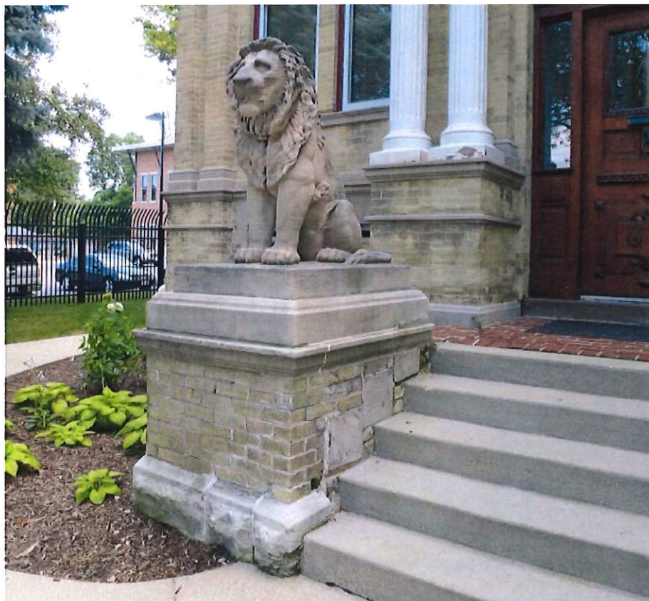
Image F: East pier – The brick solid railing wall/pier will be spot repointed using a mortar matching the original. Due to severely decomposed bedding mortar, brick may require removal and resetting in new bedding mortar. Spalling brick will be replaced with salvaged matching units. Stone units at each stair and base of pier will be reset as needed.