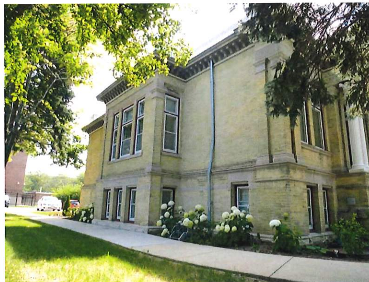
Image D: West façade, select bricks at the basement level only will be replaced with historic matching units.