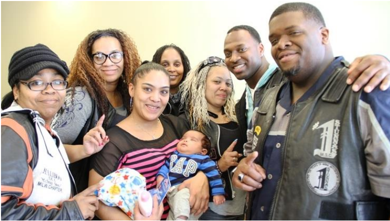
4/18/17: Community Baby Shower

Housing Authority of the City of Milwaukee Bi-Annual Report to the Zoning, Neighborhoods and Development Committee on the Choice Neighborhoods Implementation (CNI) Grant July 6, 2017