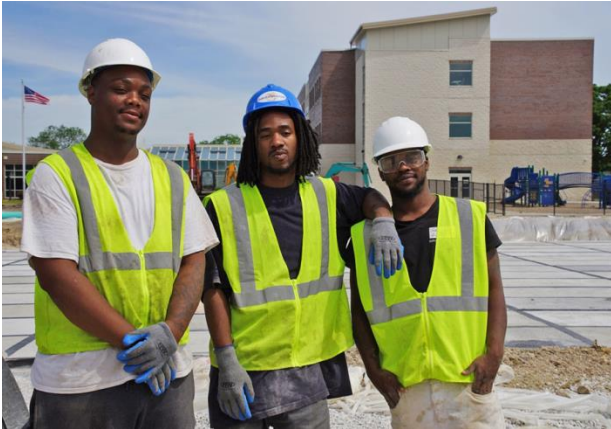
6/2017: YouthBuild construction training at Westlawn