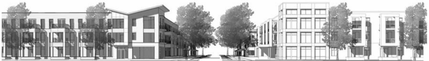
5/2017: HACM awarded tax credits for Westlawn Renaissance III - 94 mixed-income apartments