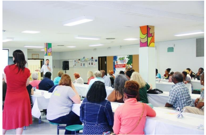
6/21/17: CNI Neighborhood Huddle