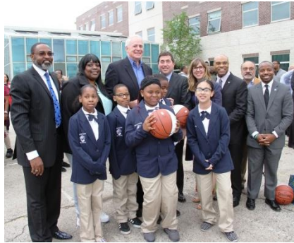
5/23/17: Milwaukee Bucks/Johnson Controls - Neighborhood Multi-Sports Complex Announcement at Browning Elementary/Silver Spring Neighborhood Center