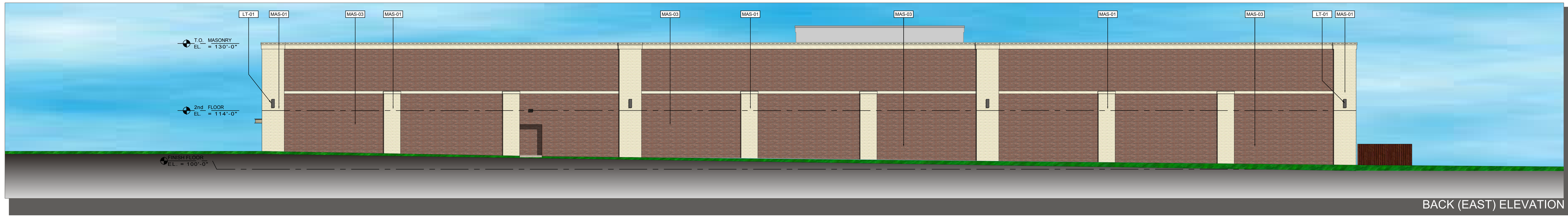
BACK (EAST) ELEVATION