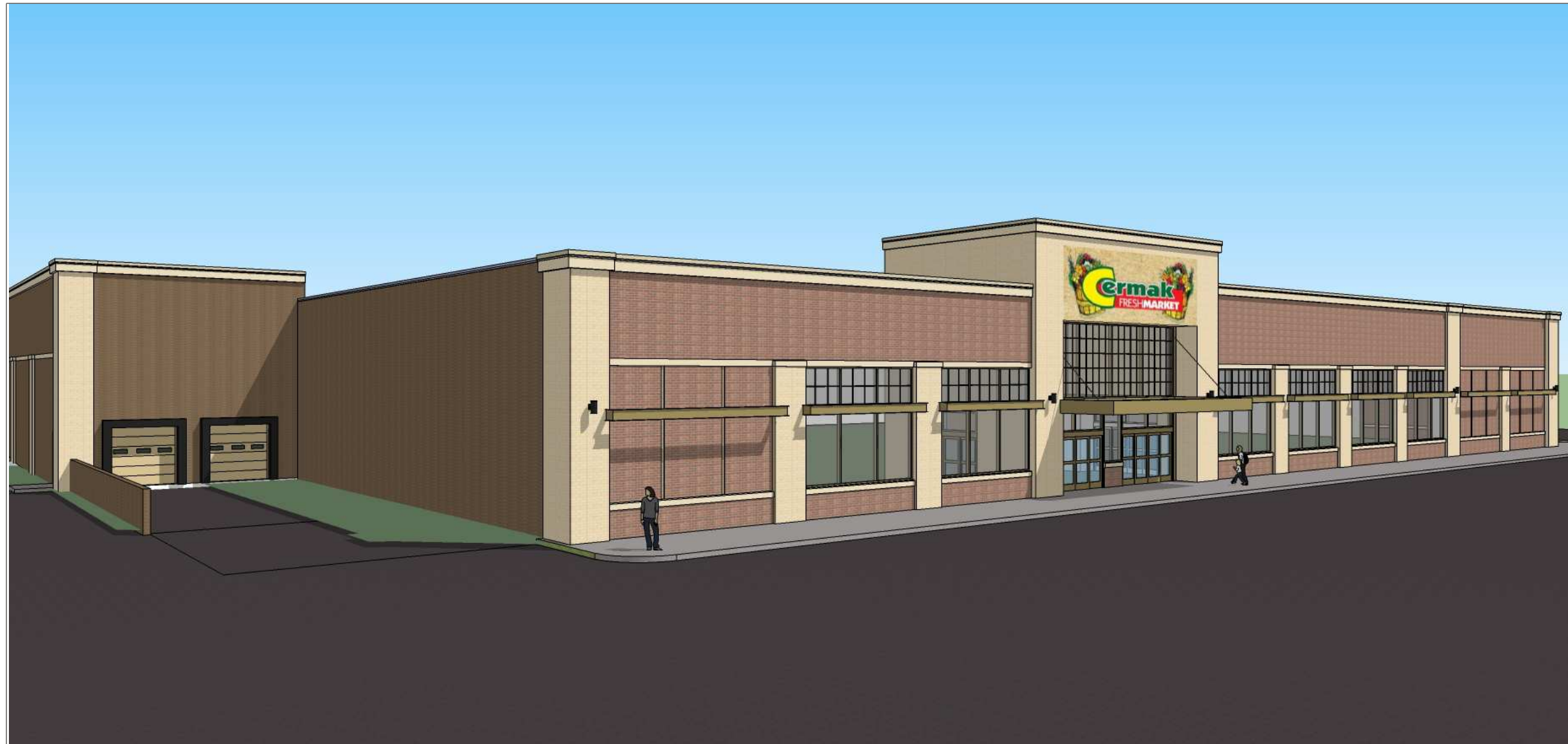
FRONT VIEW FROM NW

PROPOSED CERMAK AT FRESHWATER PLAZA 1st AND GREENFIELD MILWAUKEE, WI