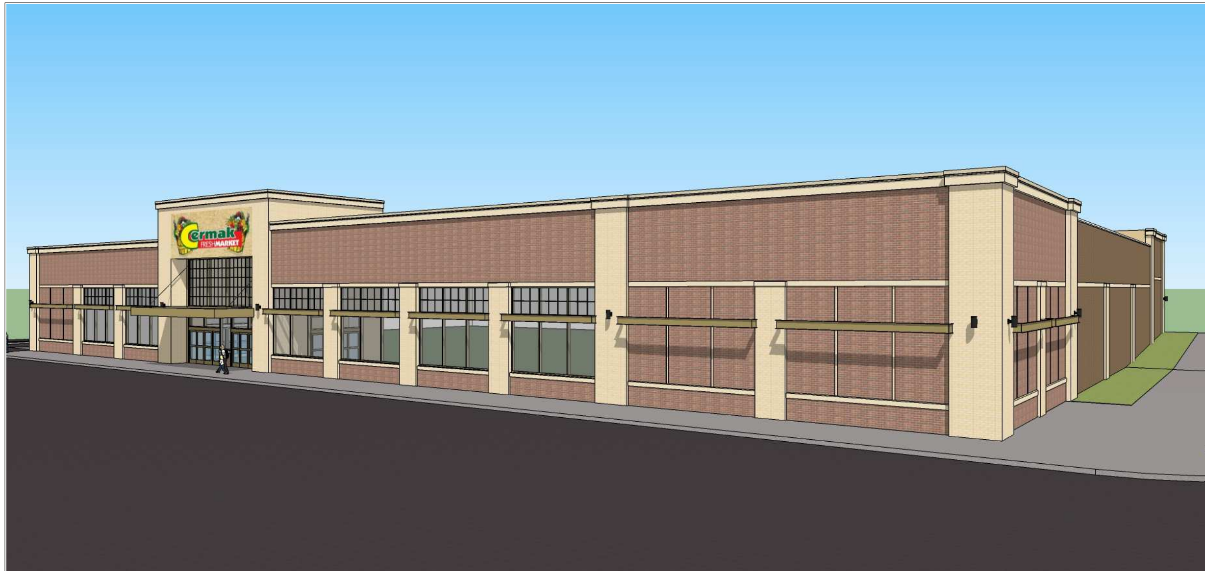
FRONT VIEW FROM SW

PROPOSED CERMAK AT FRESHWATER PLAZA 1st AND GREENFIELD MILWAUKEE, WI