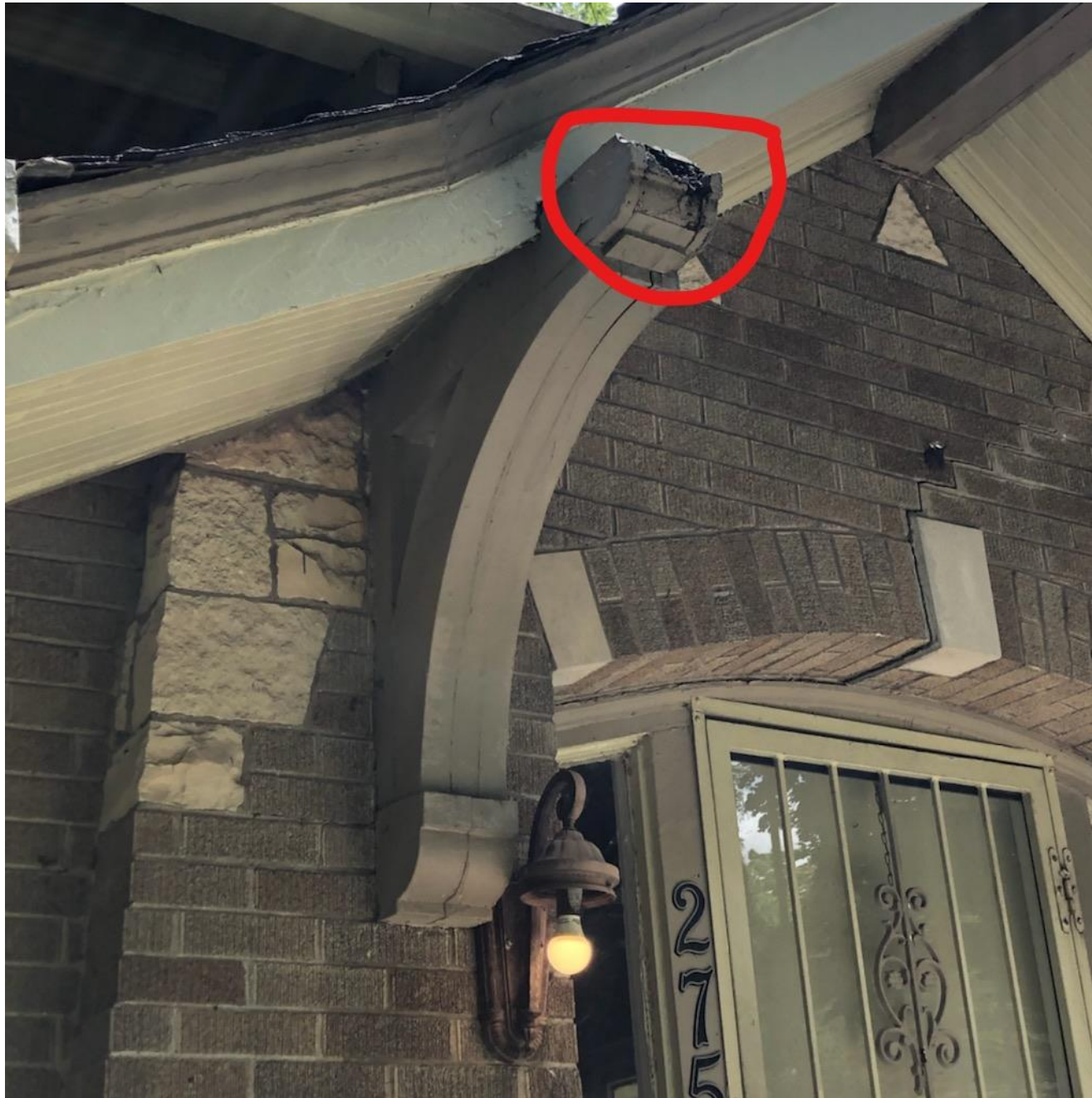
Damaged corbel at side of front door.