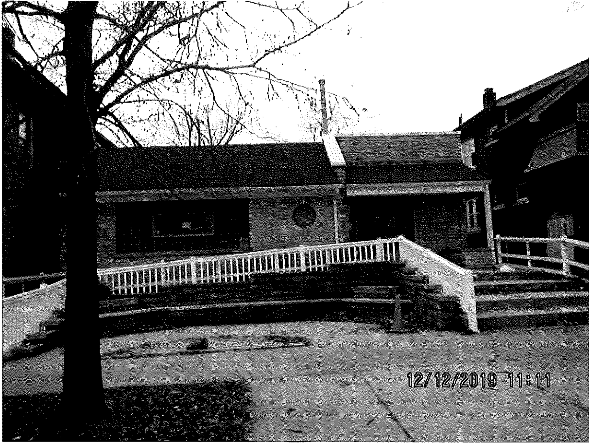
1107 W Oklahoma ave