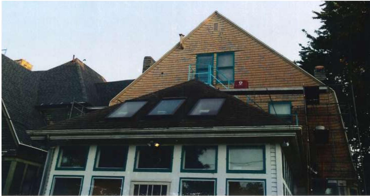
Rear view and new vent style.