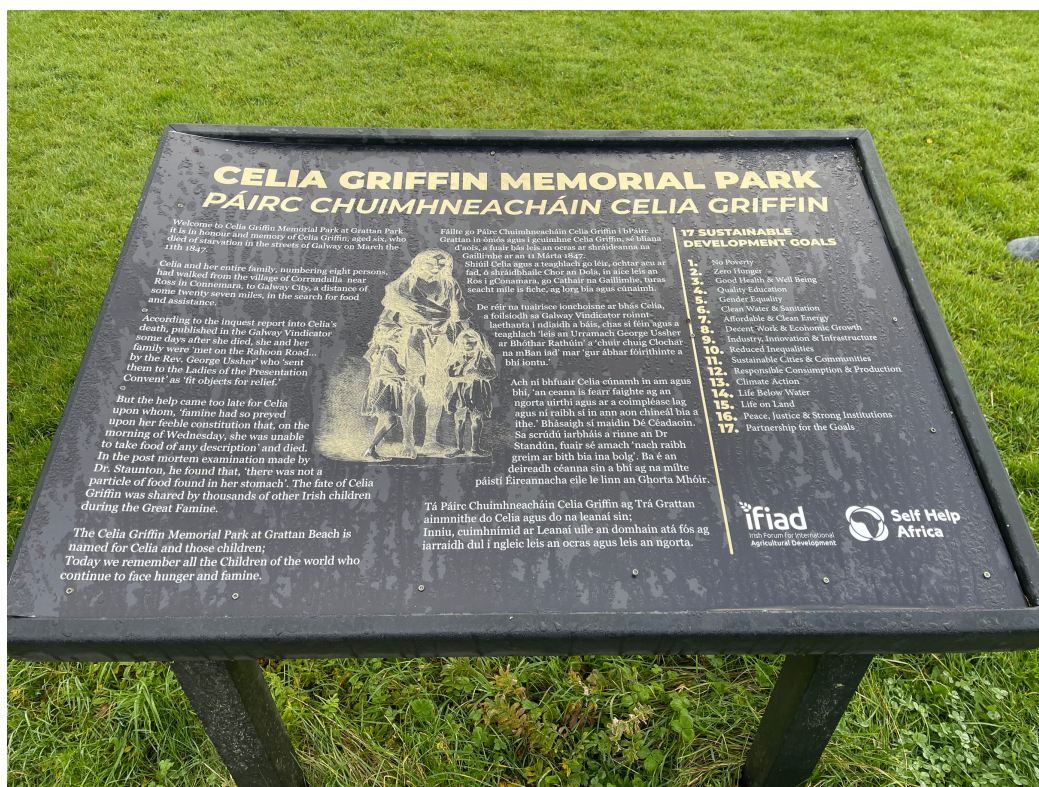
Celia Griffin Memorial Park in Galway is named after a six year old Irish Famine victim. The last line on this plaque states "Today we remember all the Children of the world who continue to face hunger and famine."