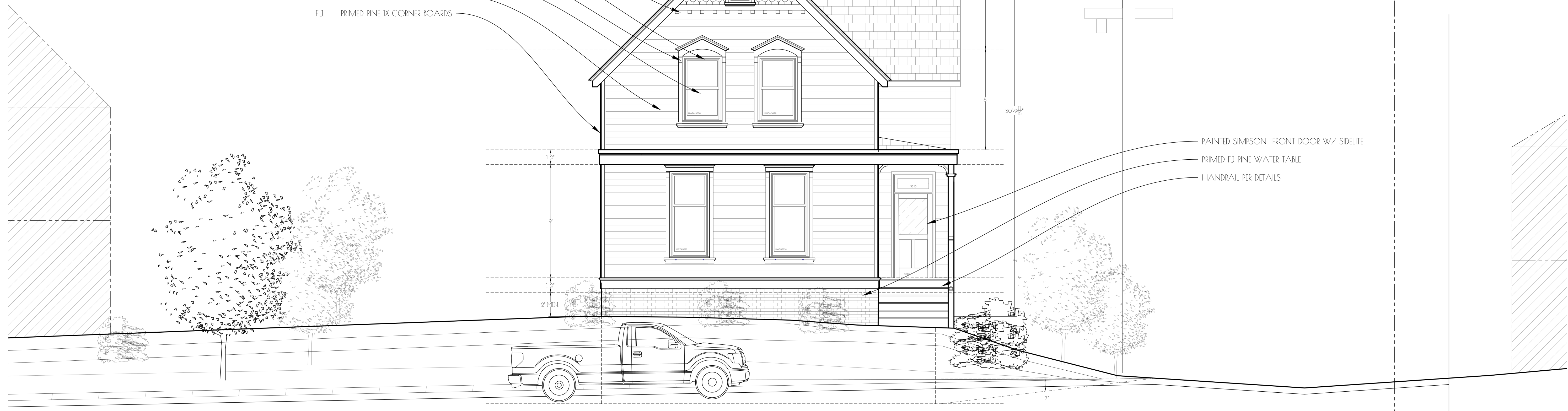
NORTH [STREET] ELEVATION 1/4" = 1' - 0"