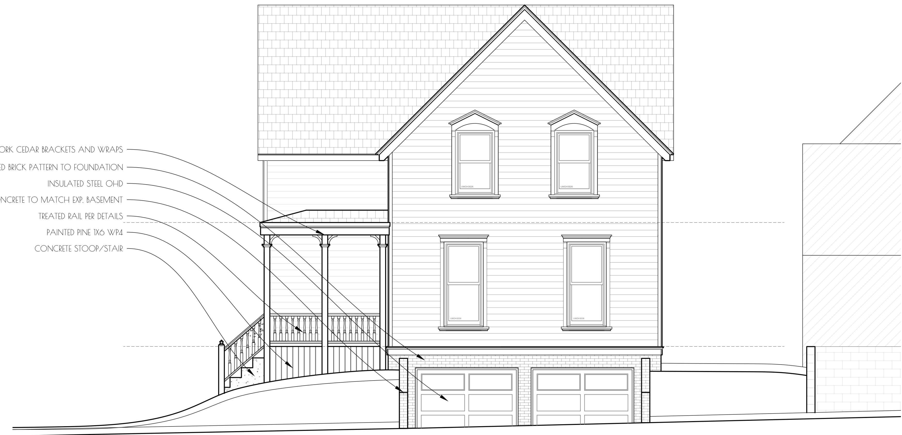
WEST [ALLEY] ELEVATION 1/4" = 1' - 0"