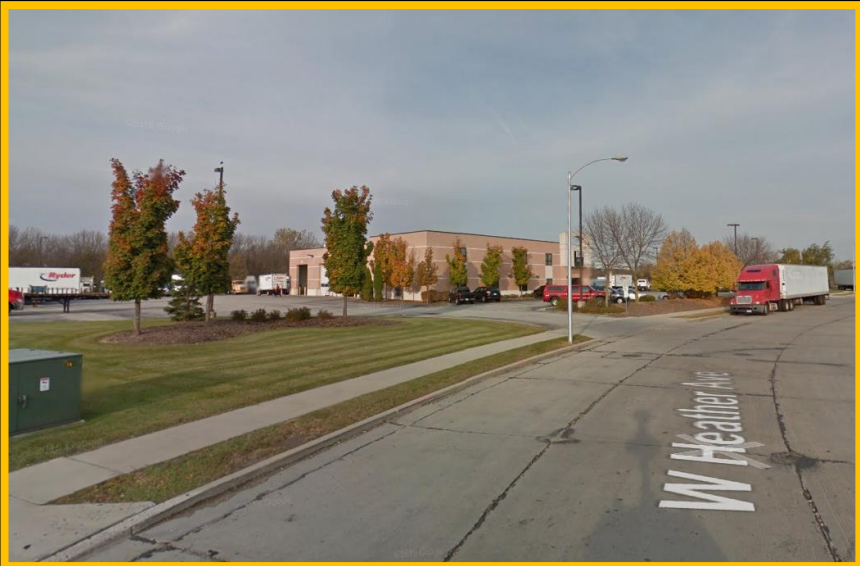
View from West Heather Avenue, looking northeast