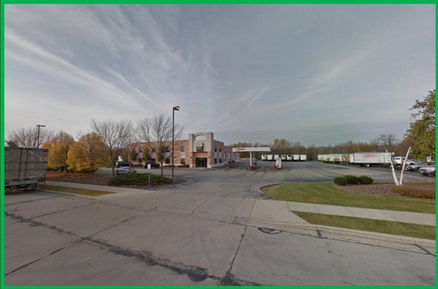
View from West Heather Avenue, looking southwest