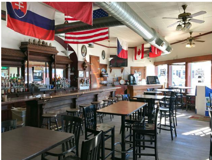
Tanzilo On Milwaukee 2017