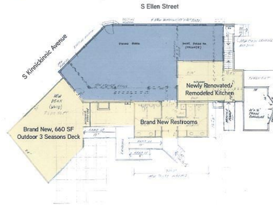
Proposal that prompted the nomination for historic designation