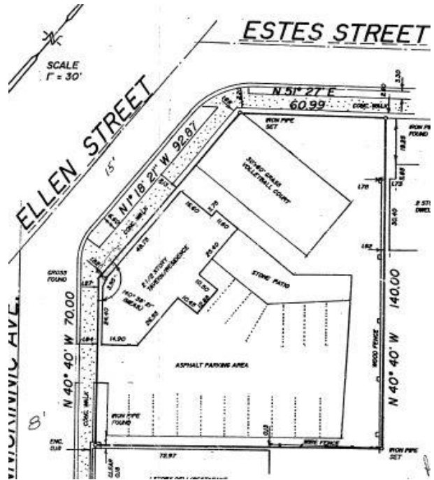
Property Survey 1992