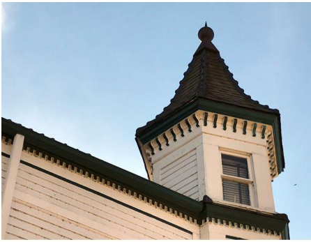
Tanzilo, On Milwaukee 2017