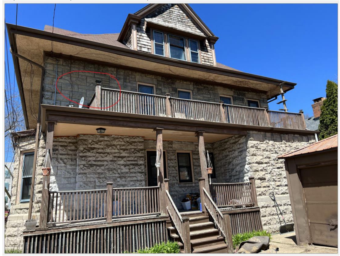
Copies to: Development Center, Alderperson