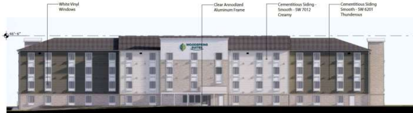
Rear (East) Elevation