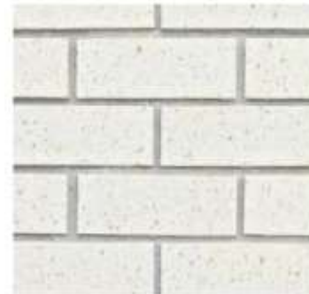
Interstate Brick - Arctic White