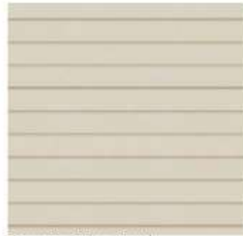
Cementitious Siding - Smooth - SW 7012 "Creamy"