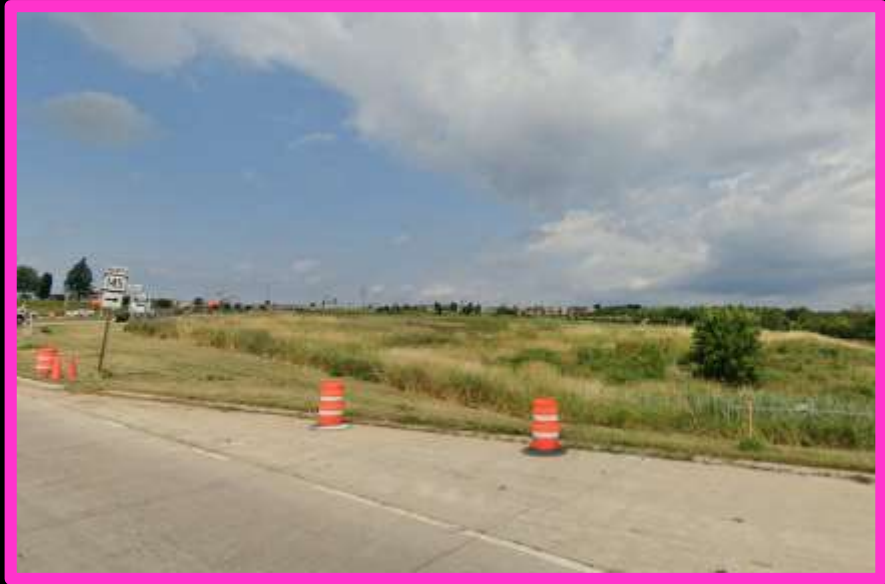
View from I-41 off-ramp looking north