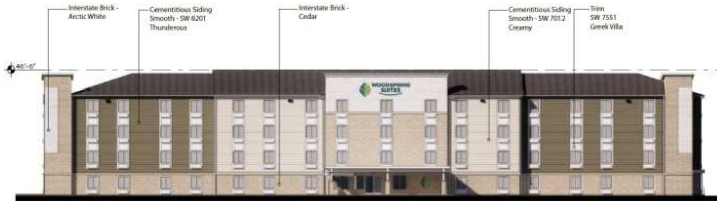
Front (West) Elevation