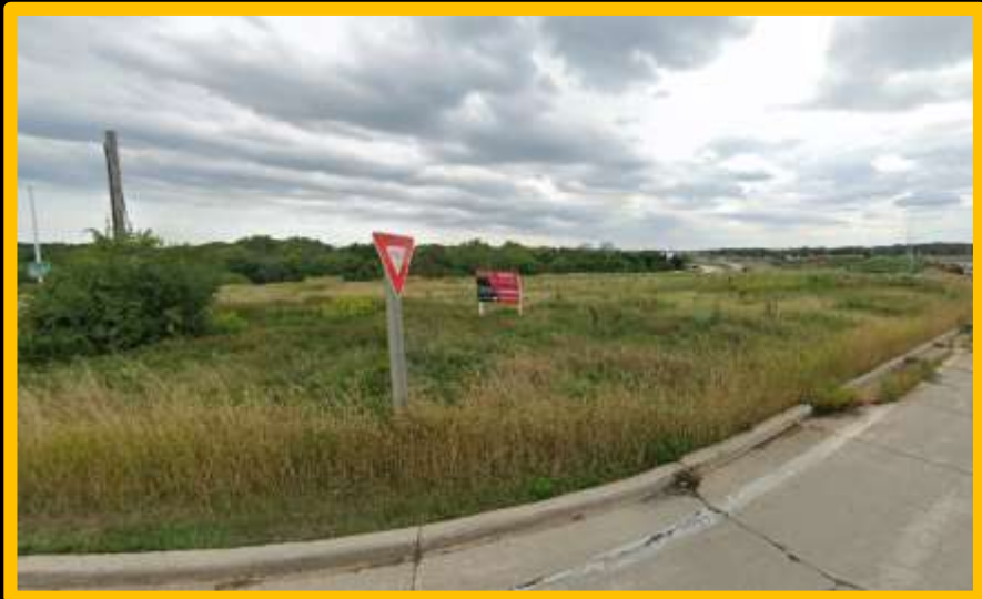
View from 124 th & Bradley looking south-east