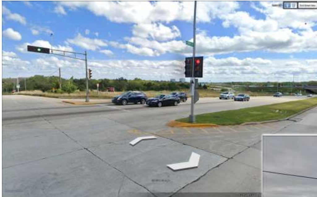
124 th & Bradley Looking Southeast