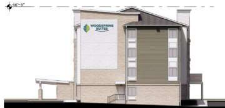
Right (South) Elevation