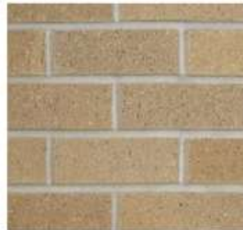
Interstate Brick - Cedar