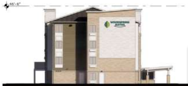
Left (North) Elevation