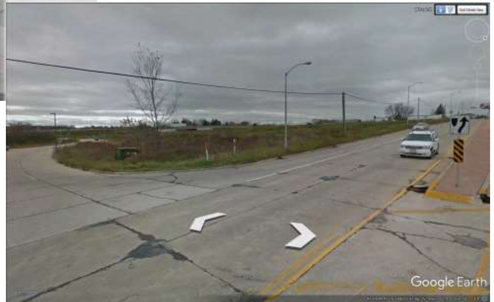
Park Place & Bradley Looking Southwest