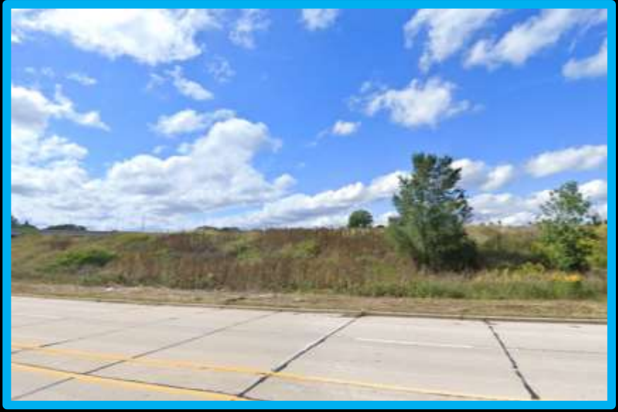
View from West Park Place looking west