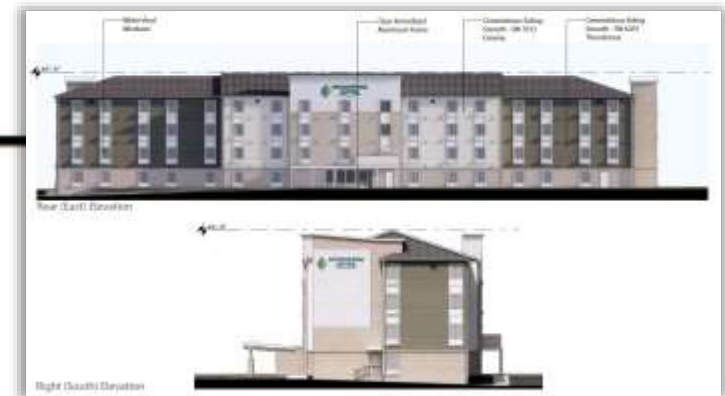
Rear (East) Elevation