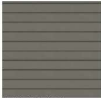
Cementitious Siding - Smooth - SW 6201 "Thunderous"