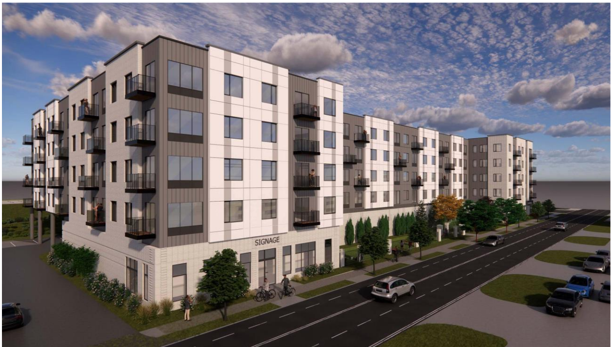
View Looking Southeast

The estimated budget is $45,300,000. The proposed financing structure includes equity from low income housing tax credits, tax exempt bond financing, Tax Incremental Financing, Brownfield Revolving Loan Fund, deferred developer fees and other grants and loans. In addition, at Closing, RACM will provide the Buyer with settlement funds held by RACM in the amount of