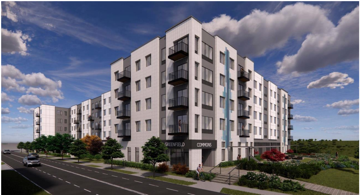
View Looking Northeast