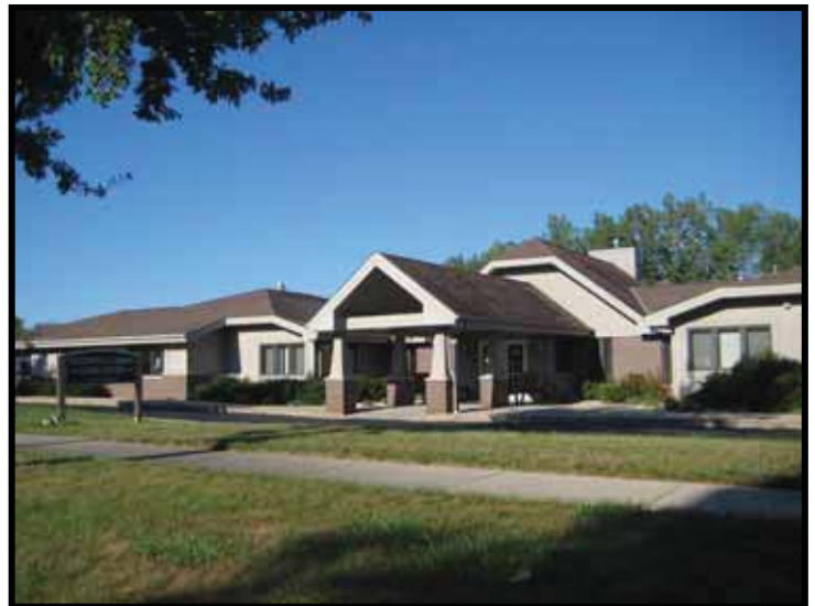
Wisconsin Lutheran Living Center Directly North of Site