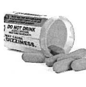
There is No 'Epidemic' of Pain... www.painnewsnetwork.org