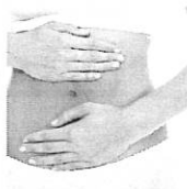
13 Tips for Living with Gastroparesis www.painnewsnetwork.org