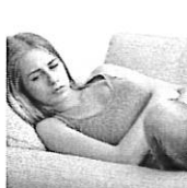
Mourning the Loss of a Life Once Had www.painnewsnetwork.org