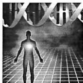
Chronic Pain Changes Our Imm... www.painnewsnetwork.org