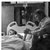
Painkillers Stolen from Dying Patients www.painnewsnetwork.org