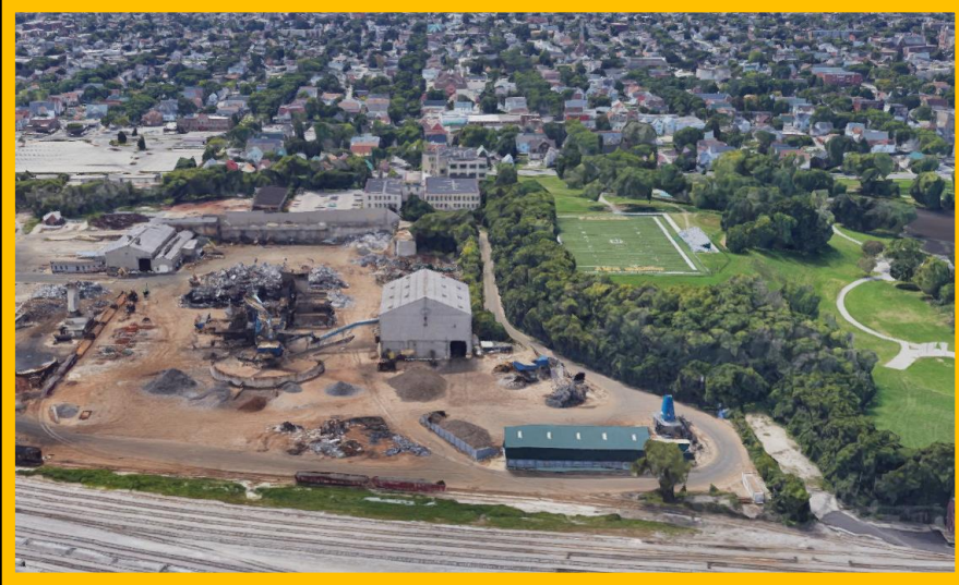
Aerial view looking south