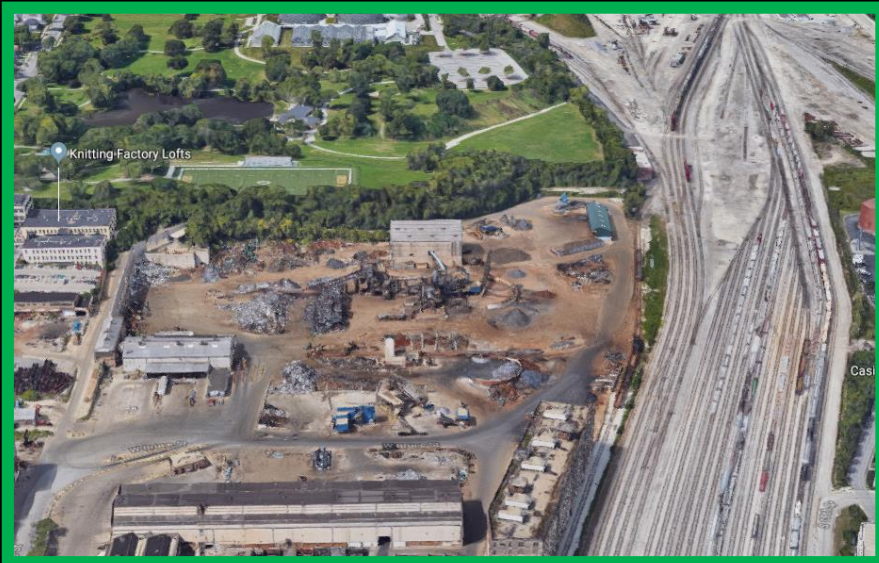
Aerial view looking west