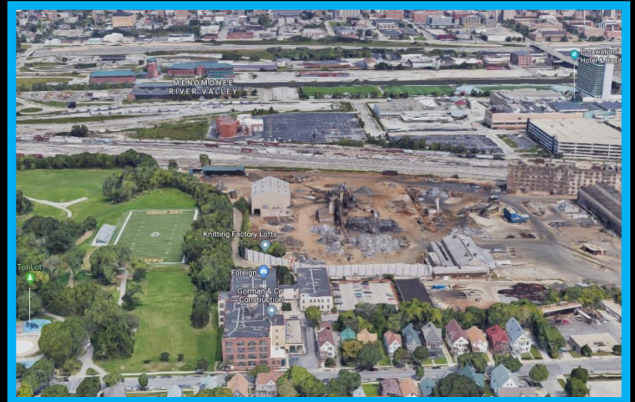
Aerial view looking north