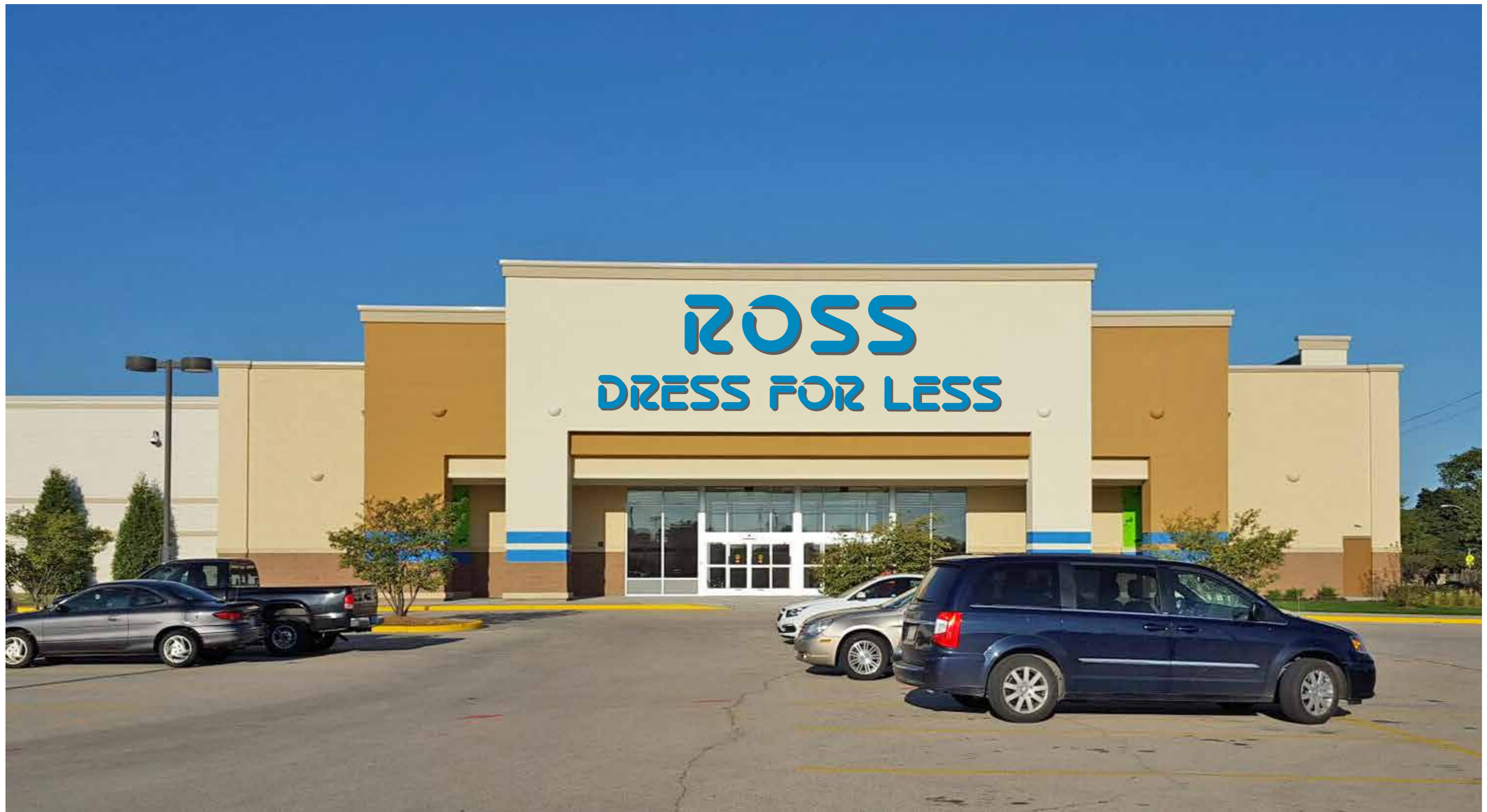
72" ROSS / 42" DRESS FOR LESS