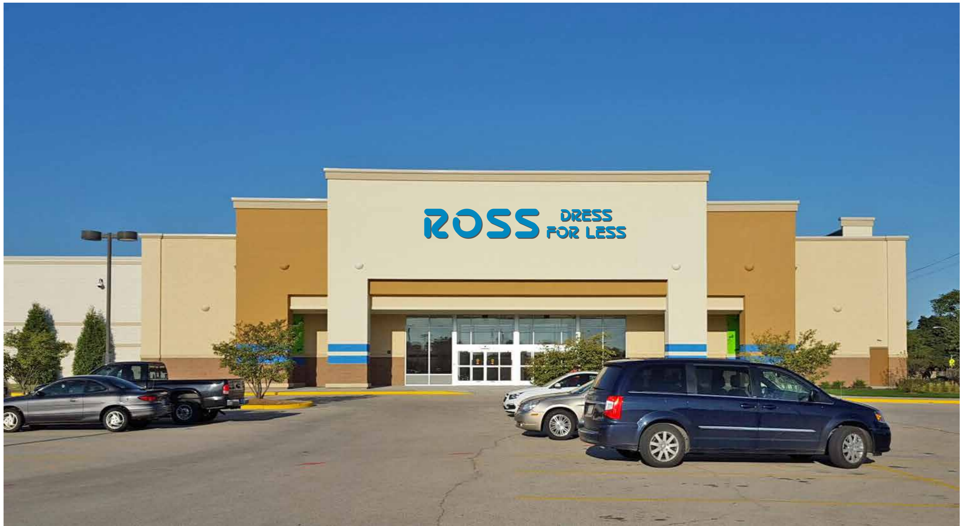
60" ROSS - 24" DRESS / FOR LESS