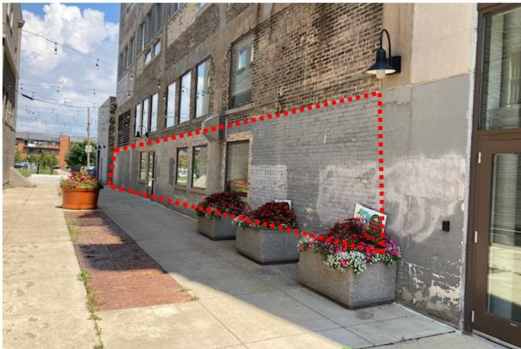
Building Wall in Pedway designated for Art Commission – looking North