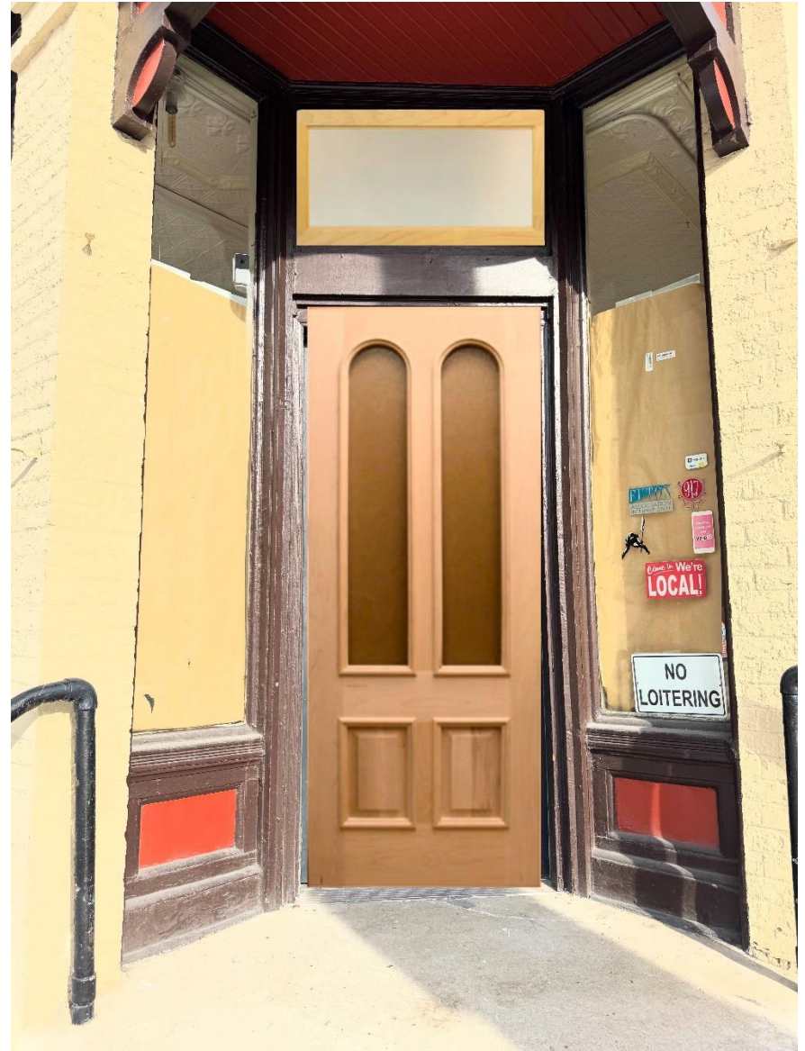
Existing doorway and doorway mockup with new Doug Fir Italianate-style door and new wood transom window