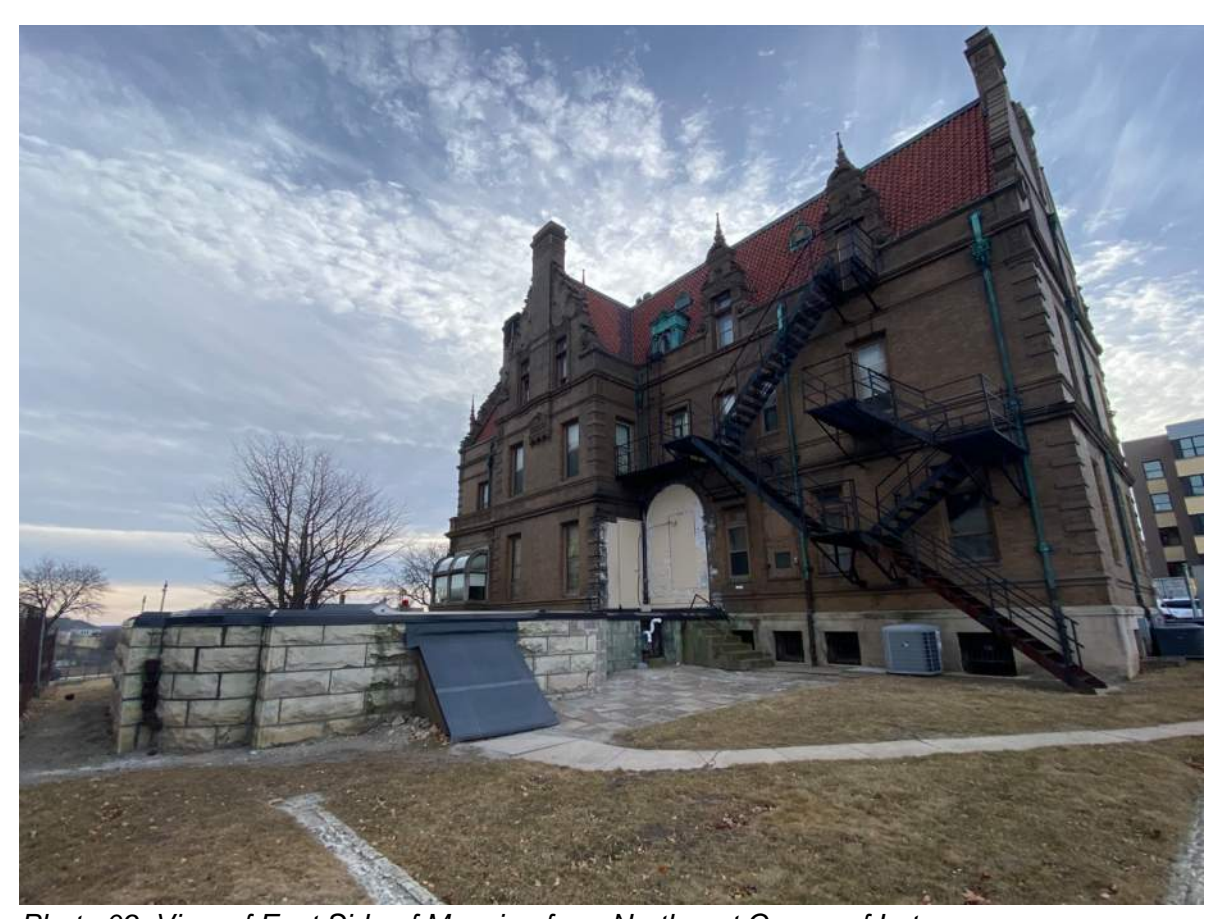
Photo 09: View of East Side of Mansion from Northeast Corner of Lot