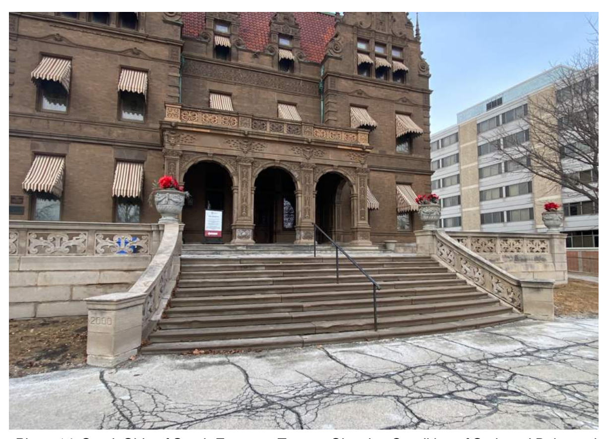
Photo 14: South Side of South Entrance Terrace Showing Condition of Stair and Balustrade