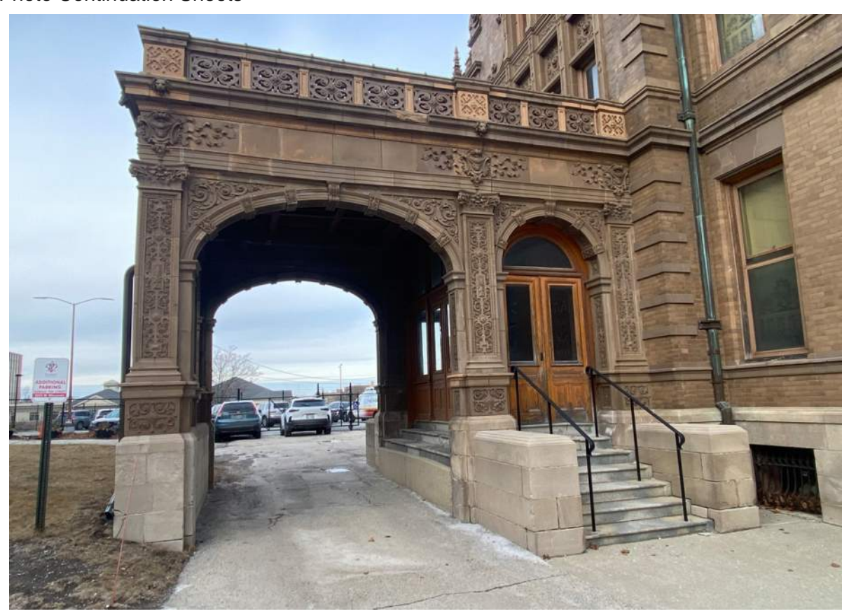
Photo 03: South View of Porte Cochere showing drop in terra cotta arch stones and deterioration of entry steps.