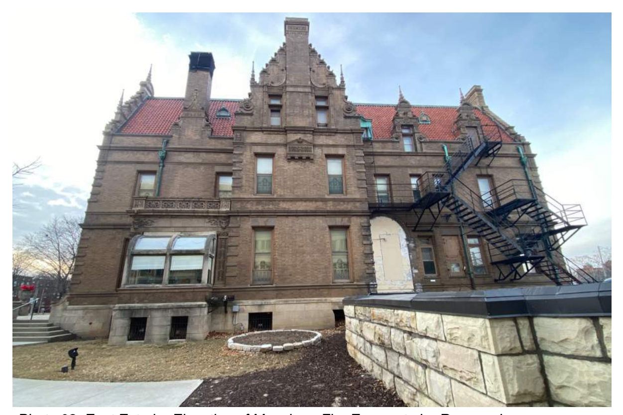
Photo 08: East Exterior Elevation of Mansion - Fire Escape to be Removed