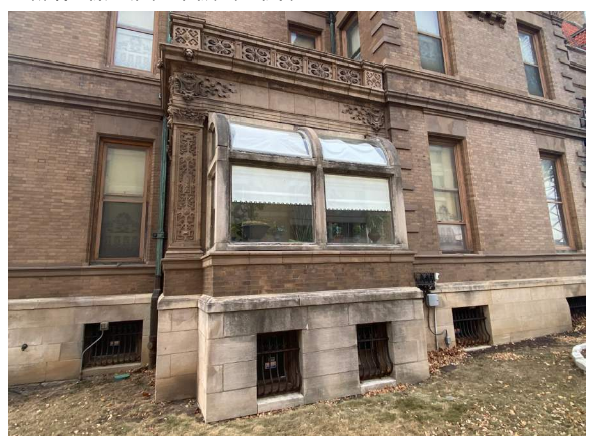
Photo 06: Detail of Conservatory. Non-original stone window framing to be removed and replaced with new to match original.