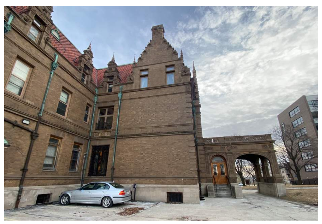
Photo 11: North Elevation at West Side of Mansion Viewed from the North