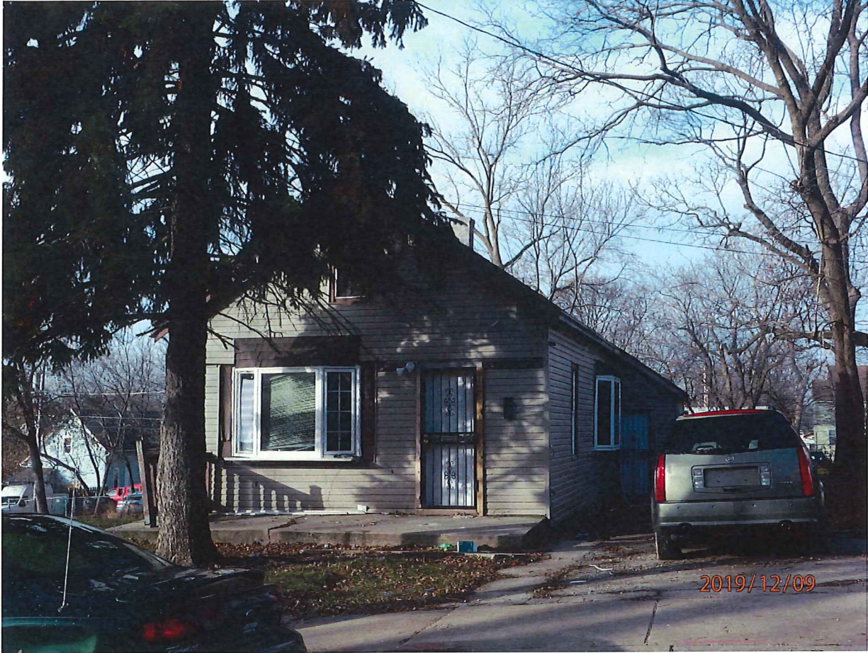
3453 north 11 th street