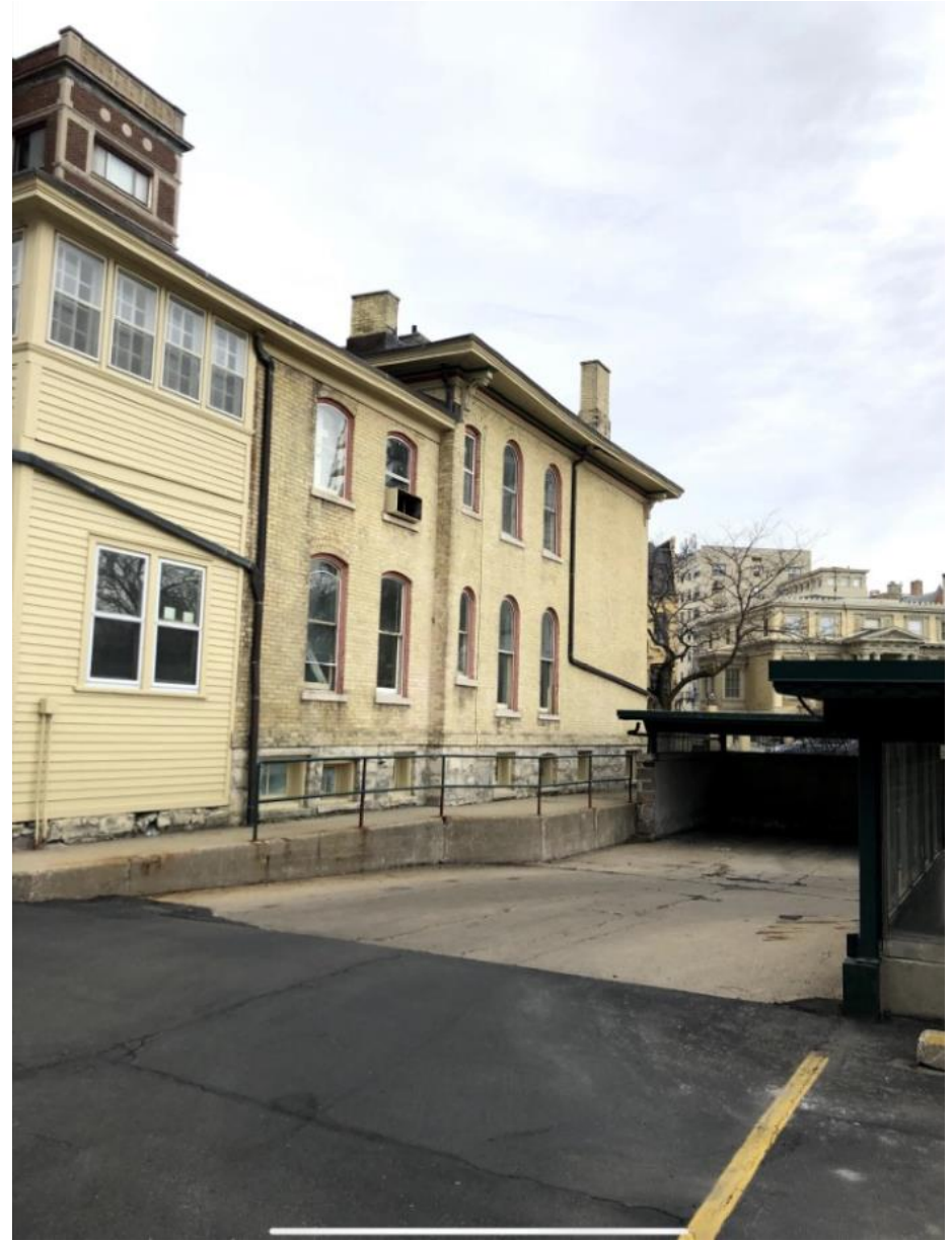
(Left) South Elevation – Two condensers will be installed along this elevation in the area indicated above. (Right) North Elevation