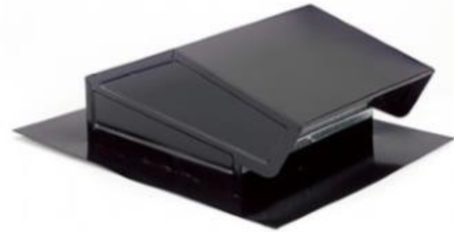
(Above) Sample image of exhaust louver to be installed on the roof facing the direction of the parking lot