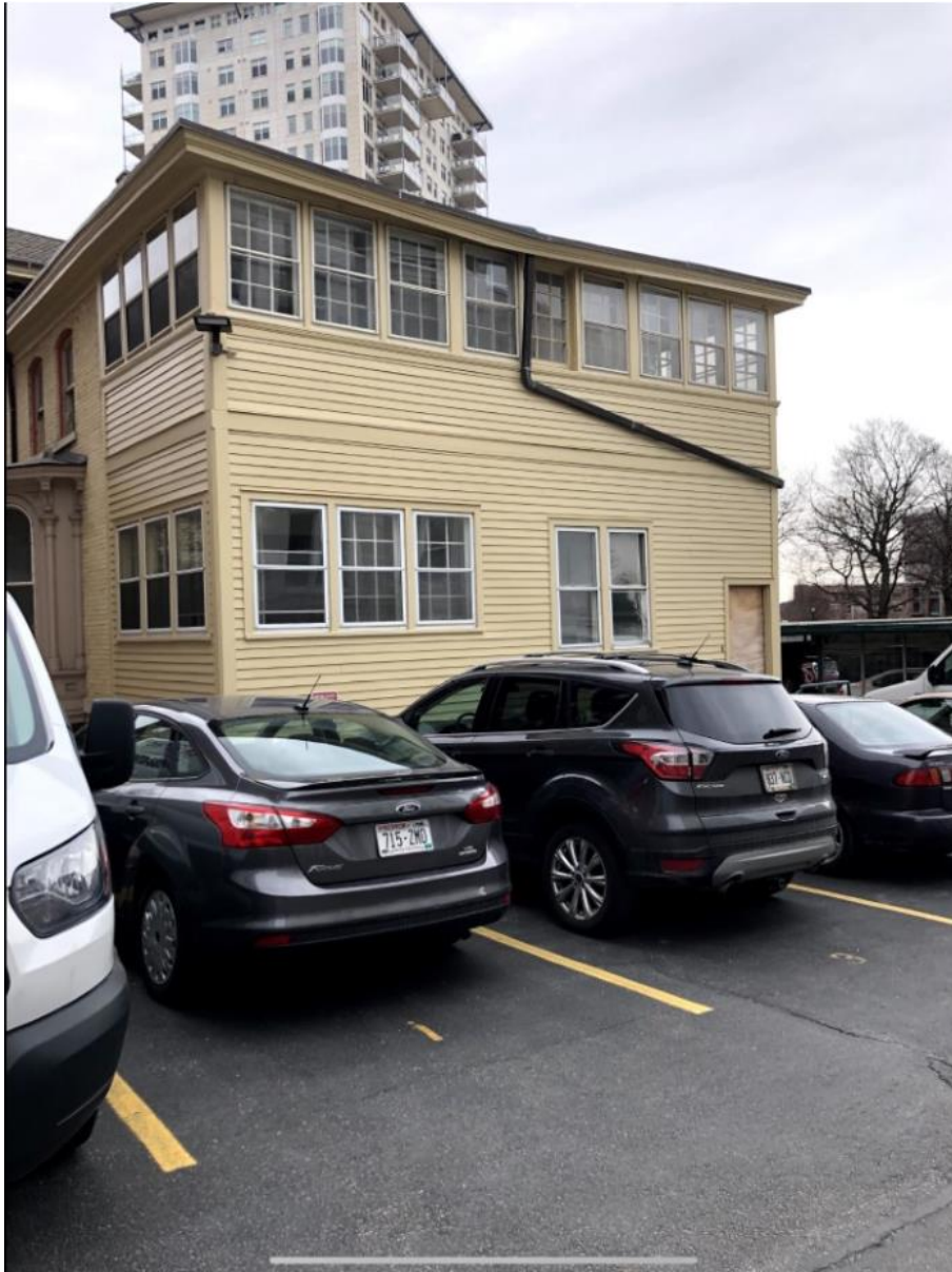
(Left) Photograph of the rear of the property