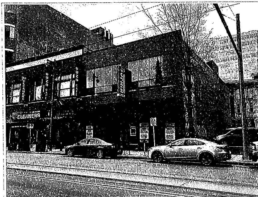
Ninja MKE Japanese Steakhouse.