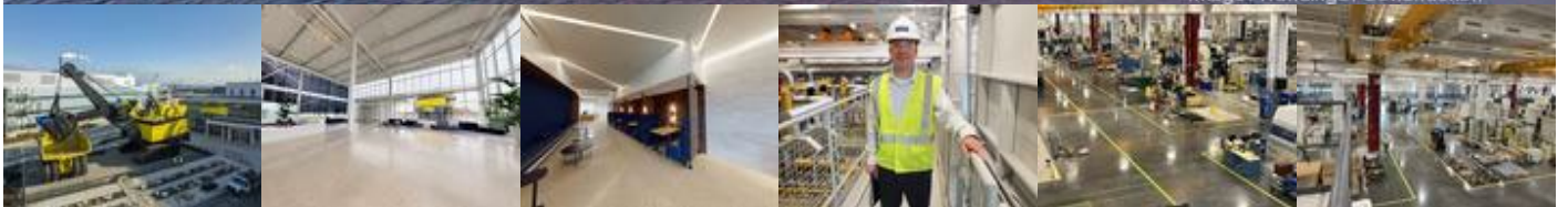
Komatsu Mining's $285 million office and plant complex in Milwaukee's Harbor District.