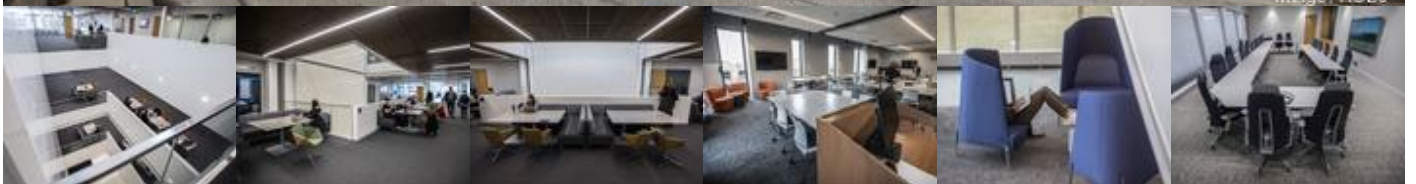
The facility houses the College of Business Administration.