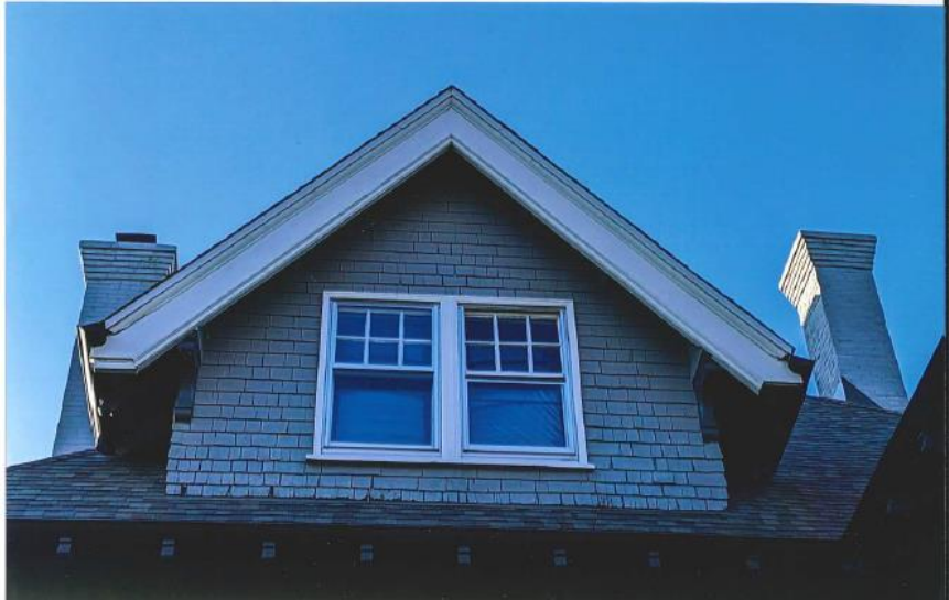
East and west facing third floor windows.