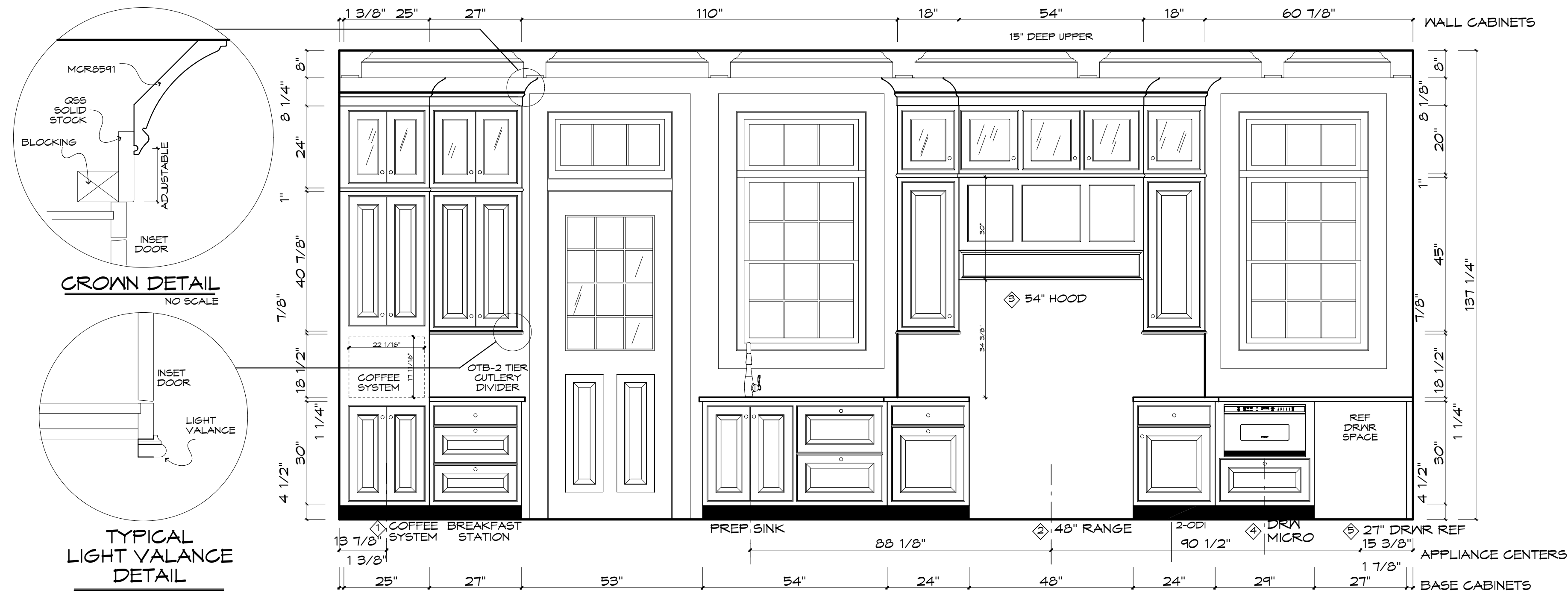
A RANGE WALL ELEVATION SCALE: 1/2" = 1'-0"

ALL PLANS DETAILS, DESIGN AND SPECIFICATIONS DETAILED HEREIN SHOULD BE FIELD VERIFIED AND ALL STRUCTURAL DETAILS SUBJECT TO APPROVAL OF LOCAL, STATE, AND NATIONAL BUILDING CODES AS INTERPRETED BY LOCAL AUTHORITIES.