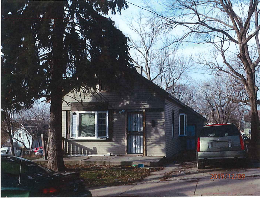
3453 North 11 th Street