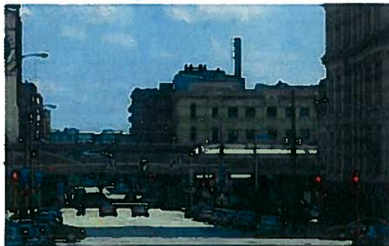
North Broadway at Michigan St. connecting south to the Third Ward