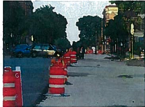
East State Street under reconstruction, a conversion to two-way circulation

This map is included to summarize the streets affected by strategic policies and project initiatives. This map should be considered during future planning purposes and is not intended to specifically require or limit improvements and implementation will likely be tied to other project initiatives.