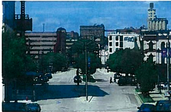
Juneau Ave. is a significant east-west connection