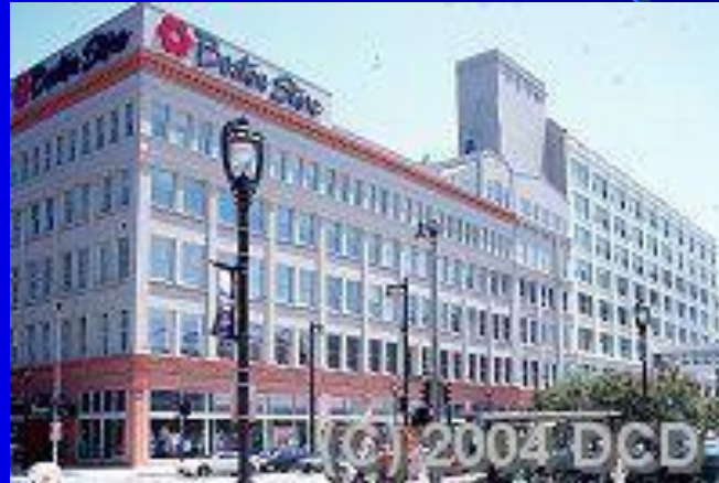
Grand Avenue and Boston Store