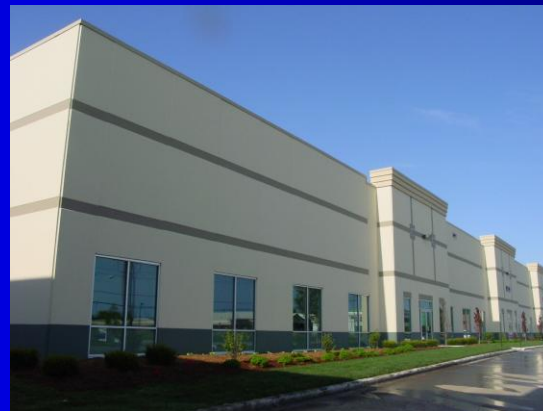
Stadium Business Park