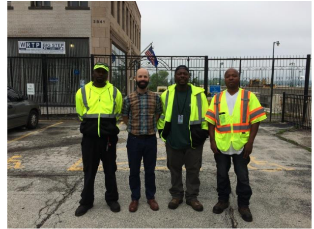
City staff (ODW, City Laborer) Alumni after speaking with current participants about civil service employment.

OSY participant interested in becoming a journeyman electrician