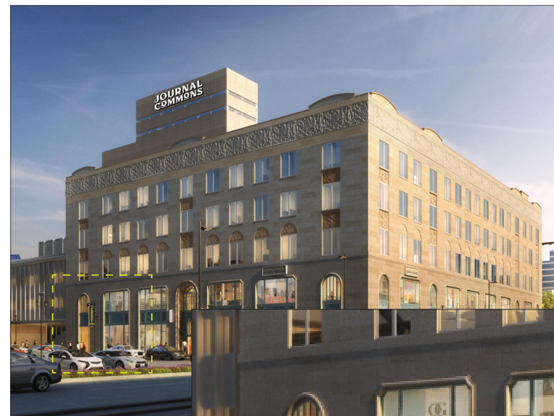
PROPOSED VIEW, NTS