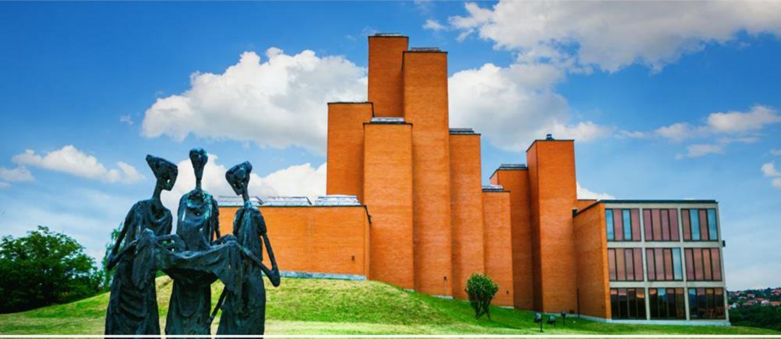
Sumarice Memorial Park