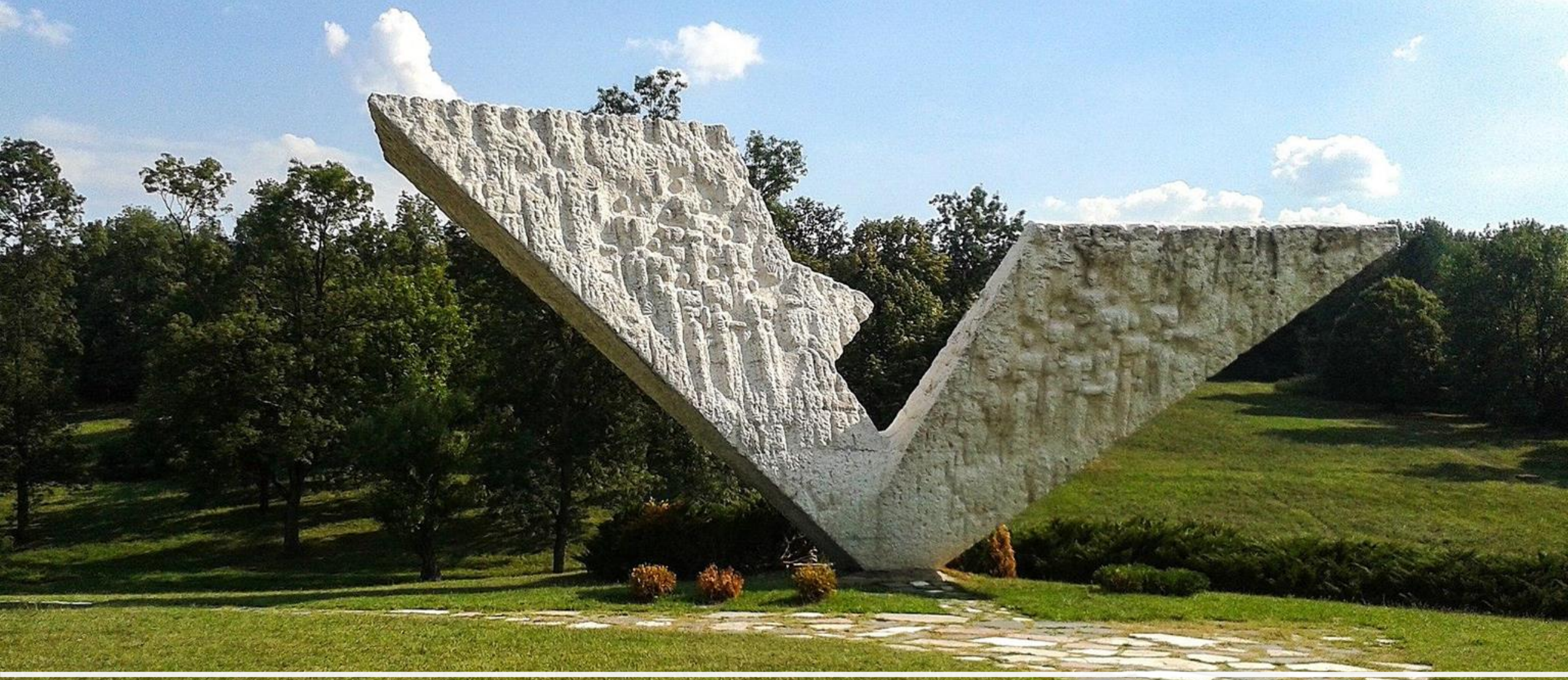
Sumarice Memorial Park