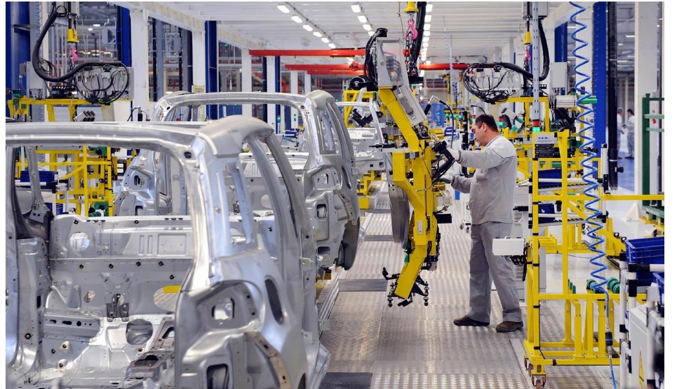
Worker assembling a car at the Fiat factory.