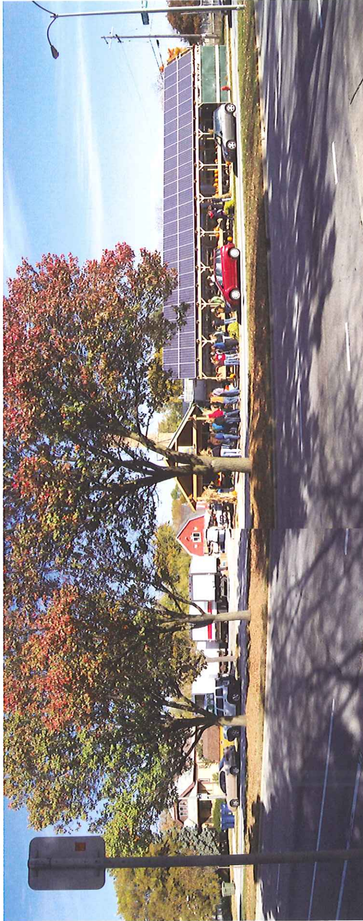
Composite view of the Project south property boundary looking north