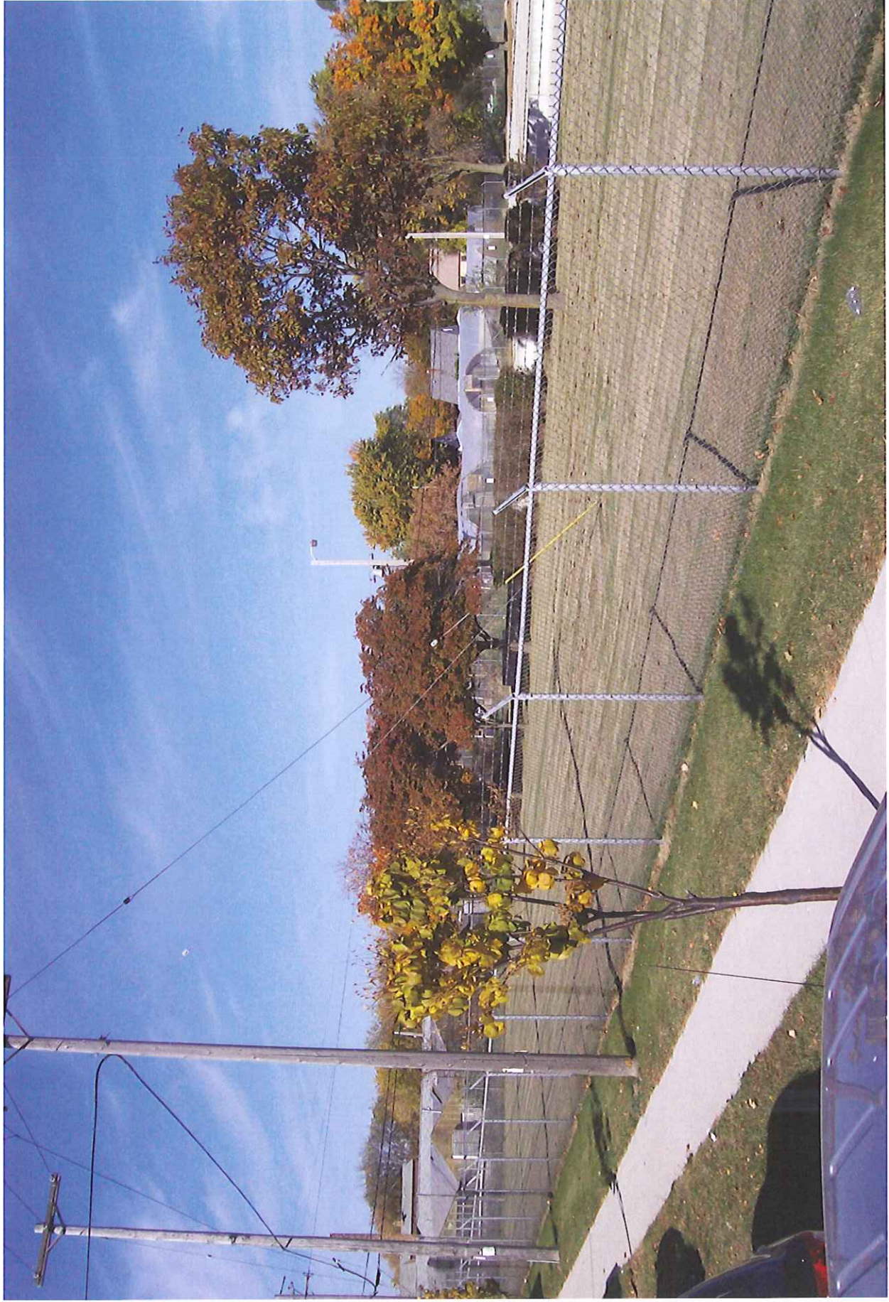
View of the Project east property boundary looking northwest