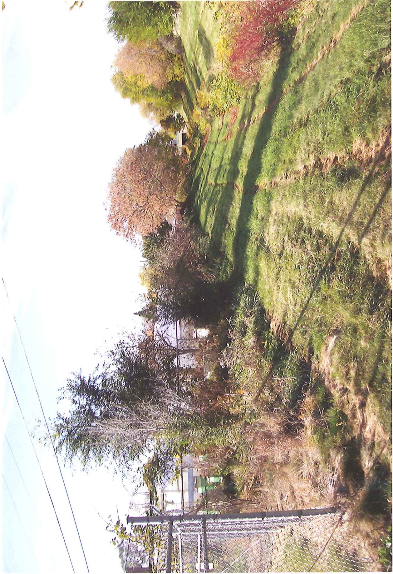
View of the Project north property boundary looking southwest