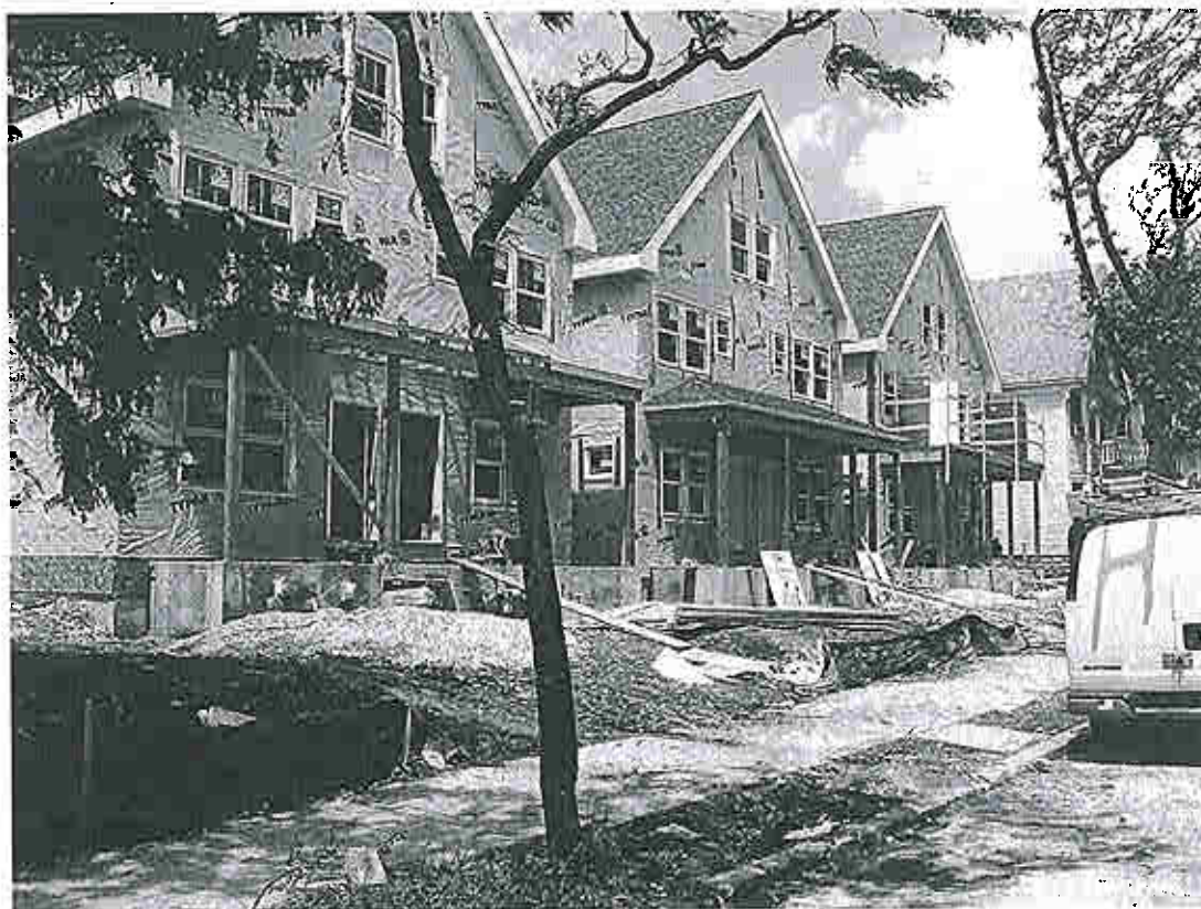
This is a picture of UMCS Townhomes (1929-1943 North 39 th Street), a 2007 WHEDA LIHTC development by UMCS. It is located north of the Development Site.