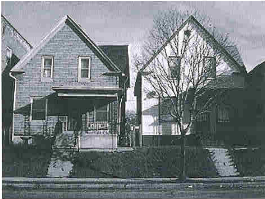
These parcels (3920 and 3924 West Lisbon Avenue) are part of the Development Site.