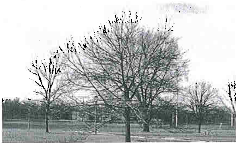
Washington Park, a 124 acre Milwaukee County Park designed by Frederick Law Olmstead is southeast of the Development Site.