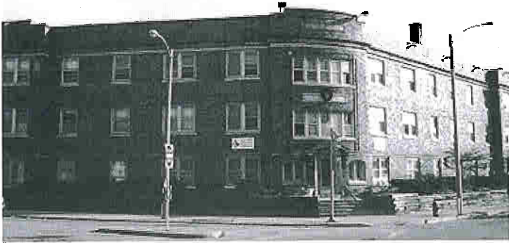
UMCS' current facility (3940 West Lisbon Avenue) is just west of the Development Site.