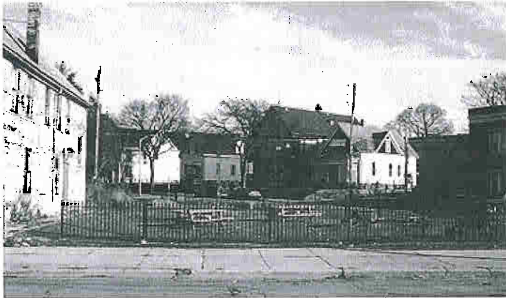
This vacant lot (3900 West Lisbon Avenue) is the easternmost parcel of the Development Site.