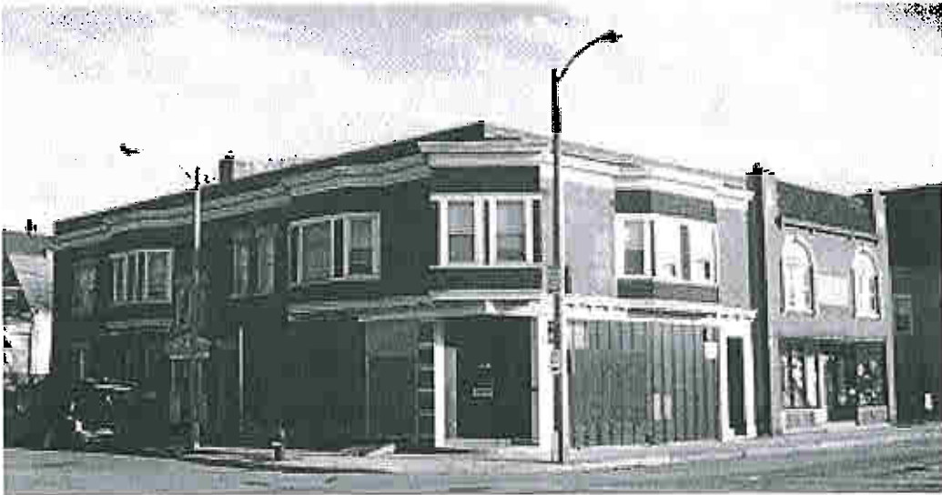
This building (3832 West Lisbon Avenue) is located just east of the Development Site.