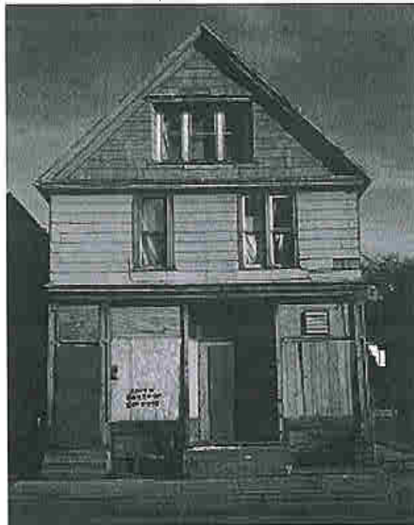
This parcel (3910 West Lisbon Avenue) is part of the Development Site.