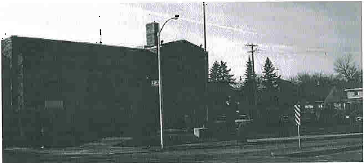
This Property (3903 West Lisbon Avenue) is south of the Development Site.