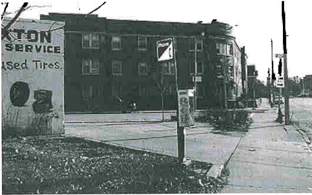
This Property (4002 West Lisbon Avenue) is just west of UMCS' current facility.