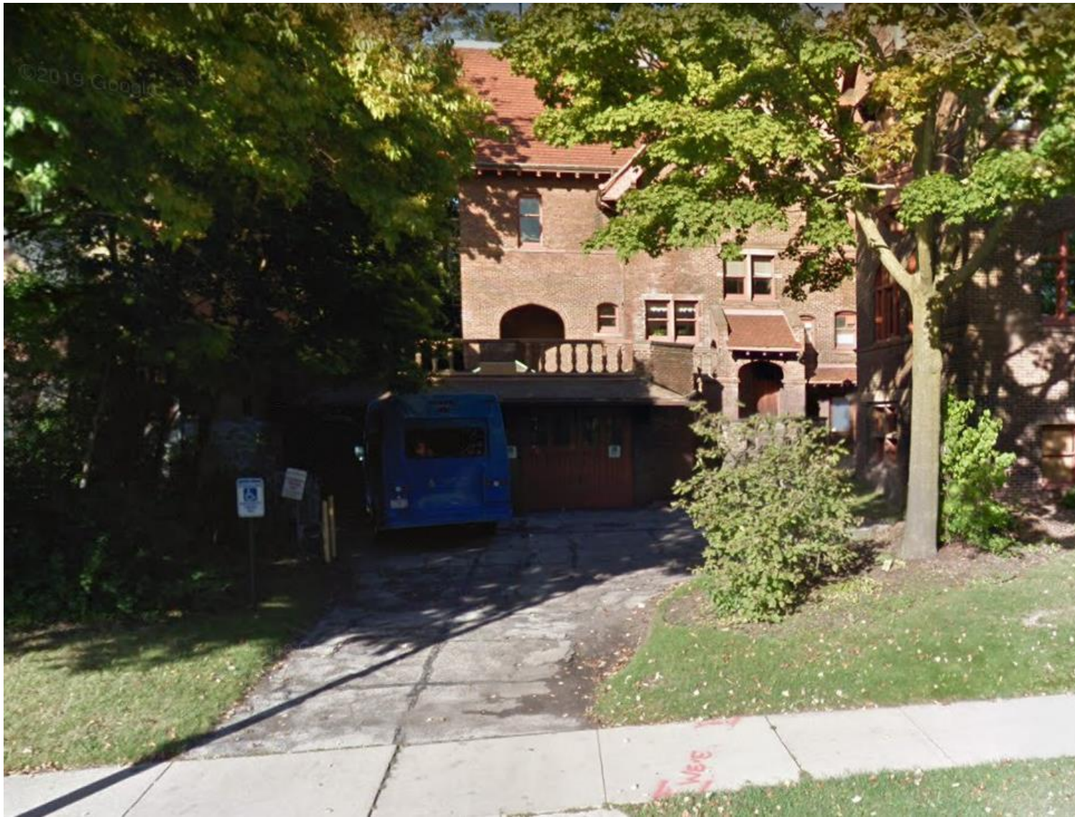
Photo ca. September 2015 indicates the previous condition of the driveway – cracked, asphalt paving.