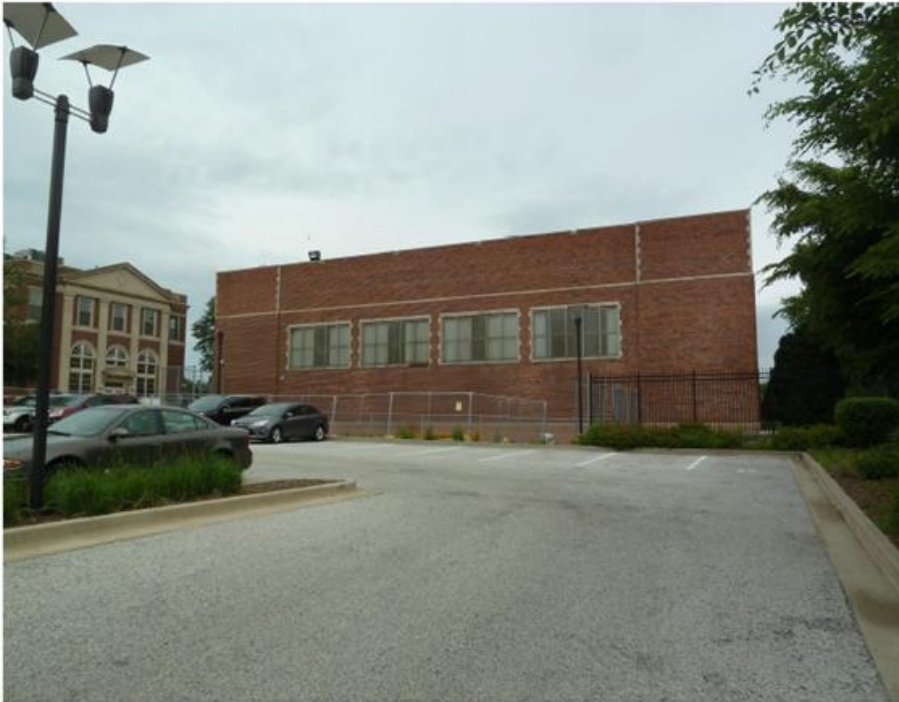
Photo 21 - North Overall at Pool Addition